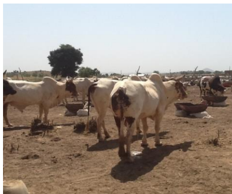
Figure 4: Concentrate Fattening of Beef Cattle in Mubi, Adamawa State, Nigeria

Concentrate fattening of beef cattle is basically done by the big time business men in northern Nigeria. The producers buy mostly adult young bulls of 2 to 4 years that have good characteristics of gaining weights within three to four months of feedlot operation. The animals are confined or tethered under the sun and fed concentrates such as cotton seed cake meal, groundnut cake meal, palm kernel meal, cowpea husk, groundnut straws, corn chaffs, corn brans and other crop residues, molasses, by-products and mineral resources. They are also given antihelminthes, multivitamins and plenty of water. They are kept for three to four months under good management and are sold especially to cattle dealers who ship them down to the southern markets. This type of production is worthwhile considering the inputs and the return at the end of the operation. It is a business worth trying with less space requirements and risk as shown in Figure 4. These findings are in agreement with that of (24).