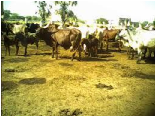
Figure 2: Beef production by Pastoralism