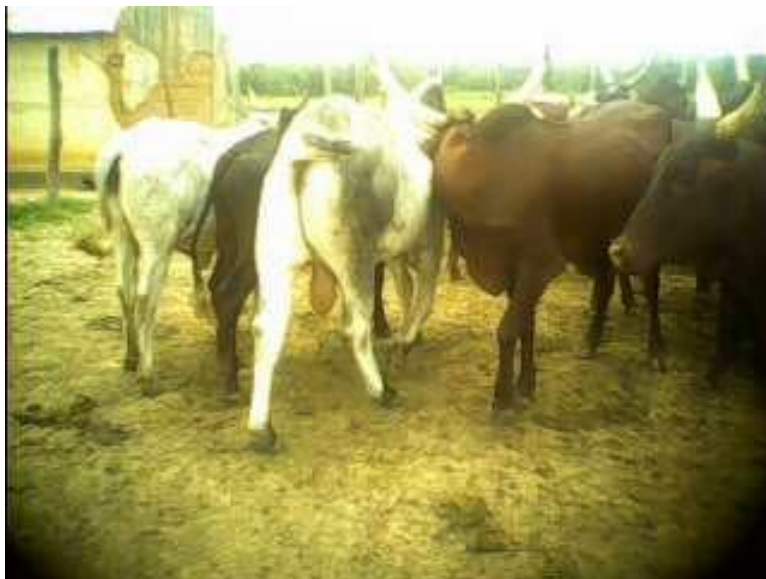
Figure 3: Beef production in the Federal Polytechnic Mubi, Adamawa State, Nigeria

healthier and eye catching because of their shining looks and good body conformation compared to the ones produced under pastoralism as shown in Figure 3. The results agreed with the report of (24).