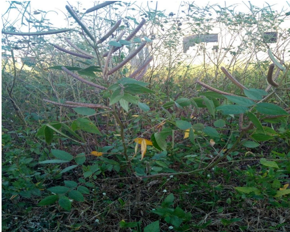
Plate IV: ‘Rai dore’ ( Senna occidentalis ), plant with the leaf (arrow), which is used for traditional treatment of brucellosis in Rafin Kanya Ward of Funtua LGA of Katsina State