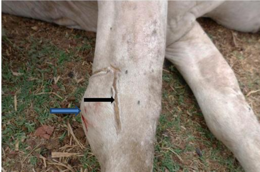
Plate III: Hygroma (blue arrow) and mark due to firing on the left knee (black arrow) as a method of treatment of brucellosis in cattle in Zamfarawa village in Bakori LGA of Katsina State