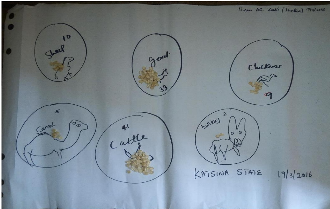
Plate I: Proportional pilling of animals kept by pastoralists in Katsina State.