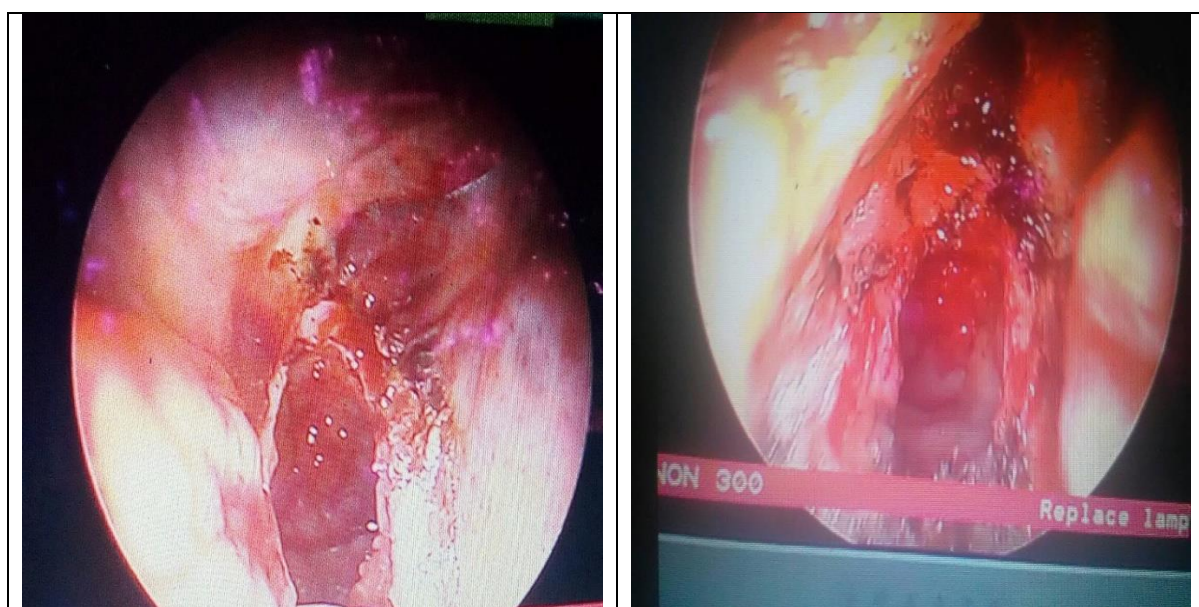
Figure 2: Endoscopic appearance of the choanae post release

Natal history noted was difficulty in breathing and breastfeeding which necessitated oxygen therapy and expressed breast milk for several weeks of life despite being born at term (39 weeks of gestational age). Multiple visits to peripheral health facilities assured the mother that the symptoms of nasal obstruction and running nose would subside with time because they were due to allergy. She was kept on repeated doses of antihistamines, oral and injectable steroids, local nasal steroids and decongestants plus antibiotics without permanent relief. Her mother denied prenatal cigarette smoking or alcohol or caffeine consumption and there was also no reported maternal history suggestive of prenatal thyrotoxicosis. There was also no family history of similar illness. When the patient was presented to the ENT clinic, rigid nasal endoscopy was done and the diagnosis of bilateral choanal atresia was established. CT scan of the nose and paranasal sinuses was ordered and confirmed the diagnosis of bilateral mixed choanal atresia (bony and membranous) (Figure 1).