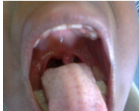
Figure 3: A photograph of a three years old boy showing a distorted and left shifted uvula following traditional uvulectomy.

The parent was calmed down and assured for a feasible good prognosis. Oral hygiene instructions and surgical toilet were done. Metronidazole syrup and Ibuprofen were added to the child's prescription. They were discharged and appointed to come back after four days for a follow up visit. About one week later (i.e. on 7 th November 2013), the child was brought to the clinic, his general condition was fair. The inflammation, tonsillar swelling and food regurgitation had subsided, the wound was healing well, whereas, discomfort on swallowing and nasal speech had not improved. Professional tooth brushing was done and oral hygiene instructions were emphasized. Antibiotics were extended for three more days and the child was set on more follow-up visits.