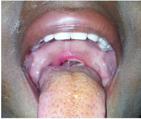
Figure 2: A photograph of the oropharyngeal region of a three years old boy showing a cut uvula, inflamed and infected areas