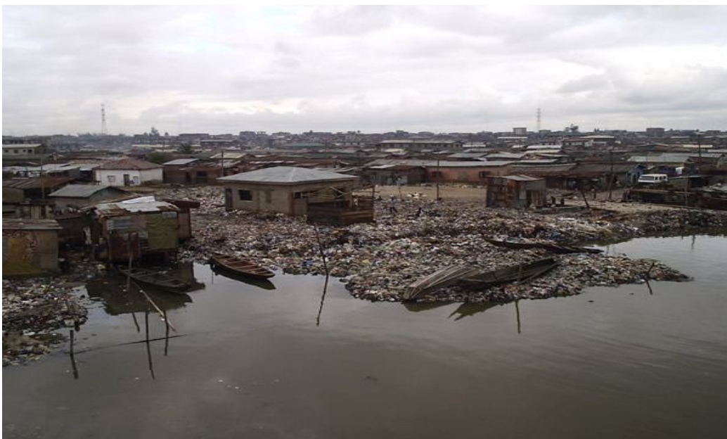
FIG. 2: TRIBUTARY OF LAGOS LAGOON AT OWORONSOKI (ACTIVITY POINT 2), SHOWING ABANDONED CANOES AND THE POINT USE FOR REFUSE DUMPING BY THE COASTAL DWELLERS.