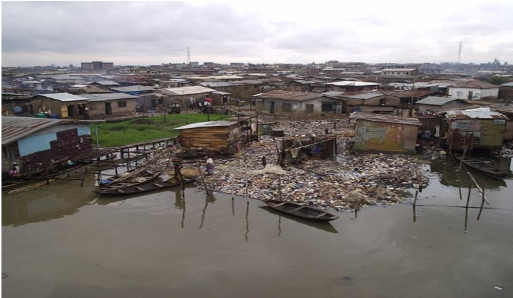
FIG. 1. TRIBUTARY OF LAGOS LAGOON AT OWORONSOKI (ACTIVITY POINT 1), SHOWING THE POINT USED FOR REFUSE DUMPING AND TOILET BY THE COASTAL DWELLERS.