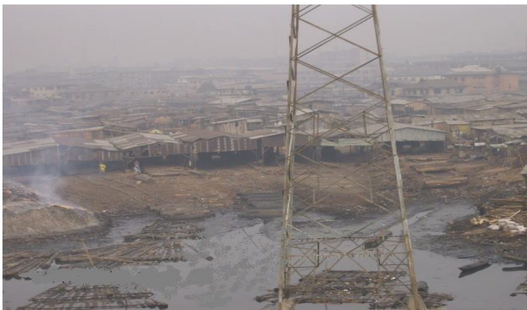
FIG. 3. TRIBUTARY OF LAGOS LAGOON AT EBUTE META, SHOWING SAWMILL ACTIVITIES.

Water samples for heavy metal determination were acidified in pre-cleaned plastic containers on the field. Each sample was collected in an acid-cleaned polypropylene bottle, which was rinsed three times with the sample solution prior to collection.