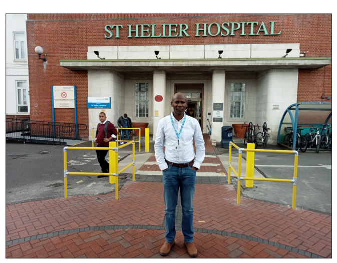
Figure 2. Outside St Helier Hospital

The work ethic and culture fostered during the observership emphasized professionalism, collaboration, and dedication to patient care. Participants engaged in a variety of activities throughout the day, including attending ward rounds, participating in case discussions, conducting clinical assessments, and shadowing consultants in various specialities. Additionally, structured educational sessions, such as grand rounds, journal clubs, and training workshops, were interspersed throughout the week to further enhance participants' clinical knowledge and skills.