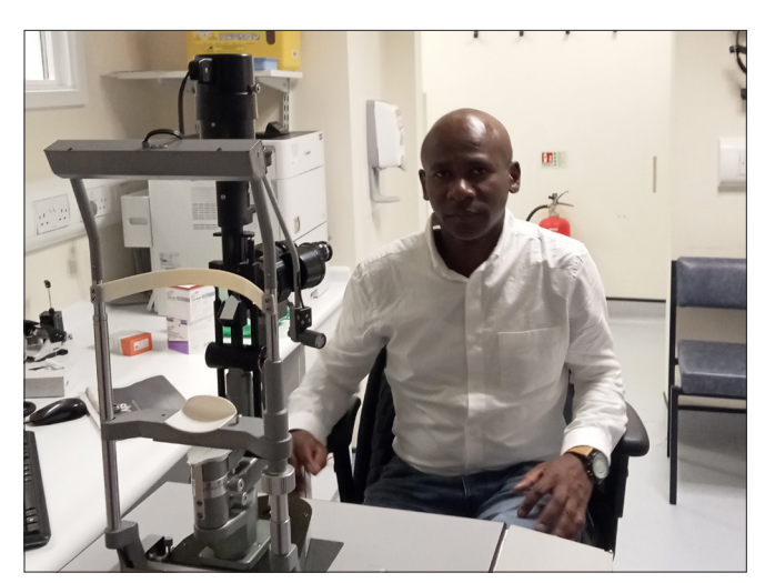
Figure 1. Working at Epsom Hospital