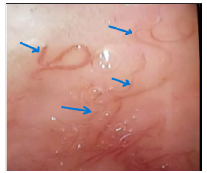
Figure 2. Panel A. The duodenal mucosa with several hookworms as indicated by the arrows

intestine and depend on the host blood.<sup>[10]</sup>