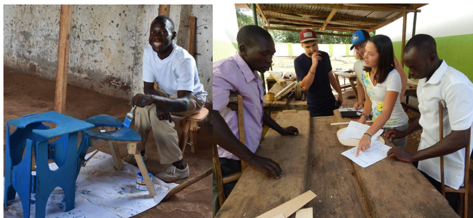
Figure 4. USD Students team and students with disabilities from Ave Maria Fabricating Devices