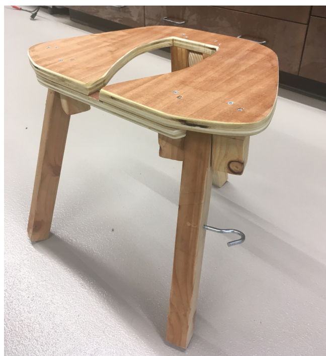
Figure 1. Tripod Stool (Credit to: L. Utrecht and M. Hey)

Figure 2 is a foldable latrine assistive device that costs approximately $13 USD to fabricate in Uganda. The hand rails provide support while the user is getting onto the seat, and there are several contact points with the ground to make the device feel more stable. The design of this device requires use of plywood that is 9 cm thick and a total of 12 hinges, and it also uses a wood paint that ensures ease of maintenance. All of the material can be found in a local carpentry shop in any rural parts of Uganda.