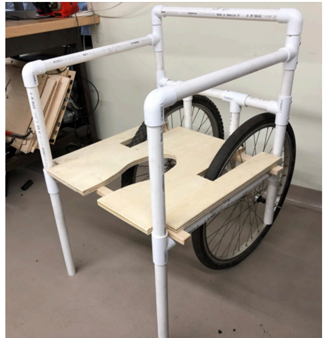
Figure 3. Mobile PVC Walker

The box seat in figure 2 was mainly designed for low-strength individuals who need the support of hand rails to lift themselves. This device received positive feedback unanimously from all users during in-field testing, and