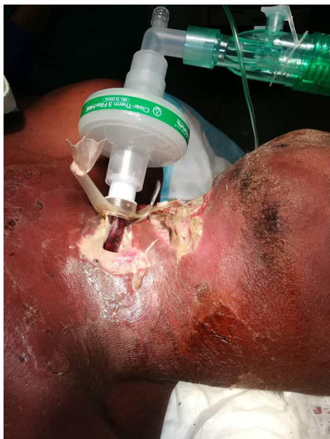
Figure 1. Clinical appearance of the patient