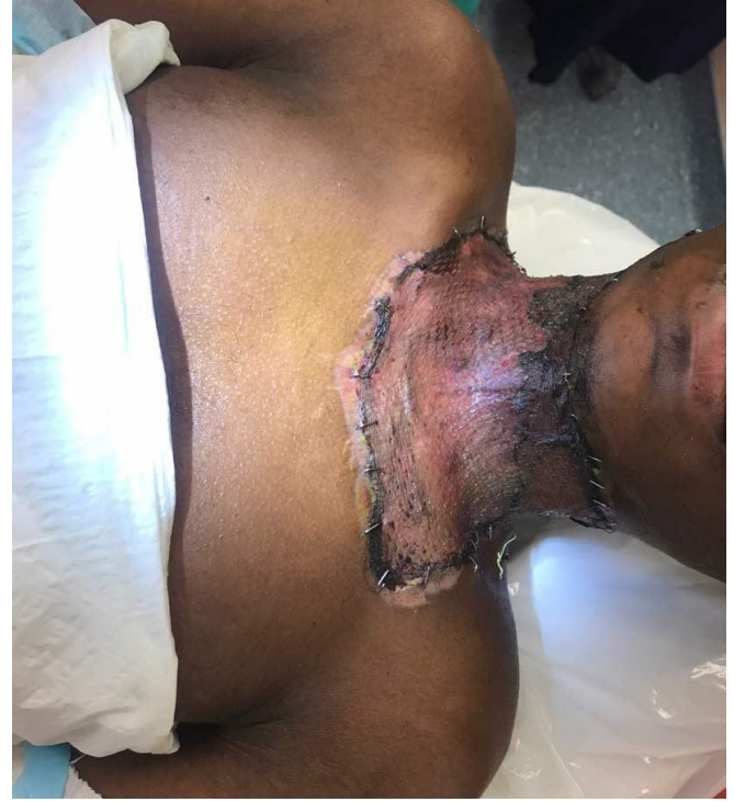
Figure 4. Skin graft

covers most of the micro-organisms known to be associated with necrotising fasciitis. However, the most important action is to bring the patient to surgery as soon as possible to control and eliminate the source of infection, that is to remove all the necrotic tissue plus extraction of the causative tooth.