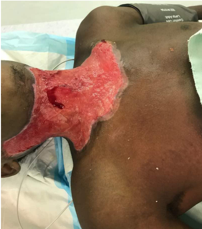
Figure 3. Surgical defect ready for grafting