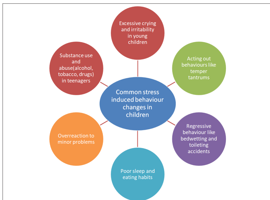
Figure 1. Common stress induced behaviour changes in children.