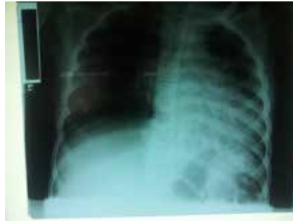
Figure 4. Post-operation X-ray after second bronchoscopy. The removal of the foreign body resulted in better left lung tissue aeration and reduced right lung hyperinflation.