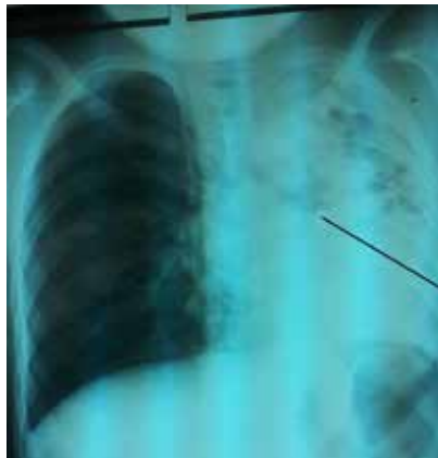
Figure 1. Pre-admission X-ray shows homogenous opacity in the left lung especially the lower lobe (Silhouette sign), foreign body (arrowed) appeared radio-opaque in the distal end of left main bronchus. There is a left mediastinal shift and compensatory hyperinflation of the right lung. Evidence of left lower lung atelectasis and upper left lobe multiple consolidations.

The cardiothoracic (CT) surgeons and Ear, Nose and Throat (ENT) surgeons were consulted for further management.