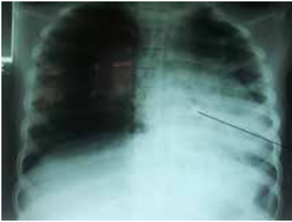
Figure 3. Post-operation X-ray after the first bronchoscopy. The foreign body (arrowed) is more visible in the distal end of the left main bronchus; despite the failed attempt there is evidence of better left upper lobe aeration compared to the pre-admission image.