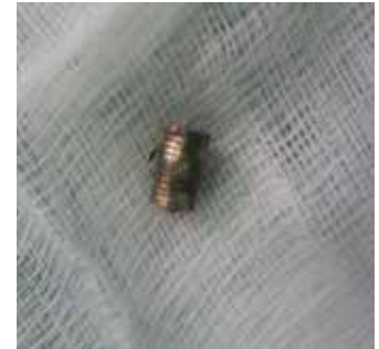
Figure 5. Metallic top of a pencil and the rubber removed from the distal end of the left main bronchus.