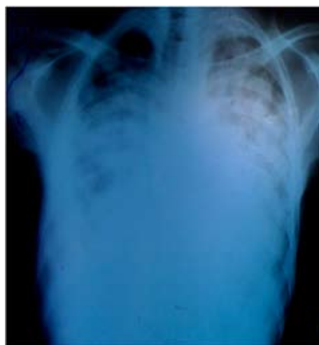
Figure 1. Chest X-ray demonstrating enlarged cardiac silhouette and bilateral pulmonary infiltrates or oedema (credit: Rae Wake. Permission obtained from patient)

The patient presented with cardiac tamponade, the most severe complication of TB pericarditis. The key to urgent treatment was the fact that the clinicians were aware of this possible diagnosis, which was confirmed with bedside cardiac ultrasonography. Emergency pericardiocentesis was possible using ultrasound to guide the insertion of