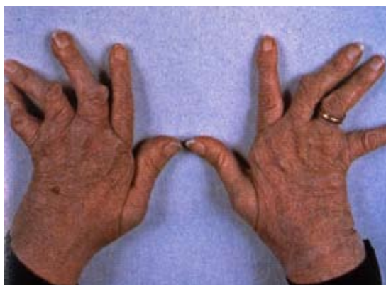
Figure 2. Progressive RA deformities

third child. She was breastfeeding and having difficulty lifting her baby, washing clothes, and cooking. Morning stiffness is present for 2 hours and is accompanied by considerable fatigue. She denied a recent cough, change in bowel habits, weight loss, or fever. A maternal grandmother became crippled at an early age and was bed-bound for the last four years of her life.