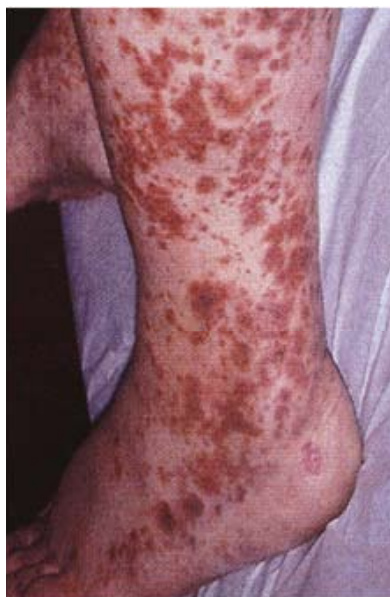
Figure 4. RA small vessel vasculitis

Timely and aggressive treatment of early rheumatoid arthritis with disease modifying medications (DMARDs) may prevent or slow the progression of joint damage. Although anti-inflammatories (NSAIDs) such as ibuprofen, naproxyn sodium, diclofenac, and others, may help with pain and stiffness, they do not prevent joint damage. NSAIDs are frequently prescribed for joint pain and stiffness in rheumatoid arthritis, but clinicians need to be vigilant with clinical and laboratory monitoring to ensure these medications do not trigger renal or hepatic damage. Patients with congestive heart failure, diabetes mellitus, uncontrolled hypertension, or advanced age may be at particular risk for renal insufficiency. Heavy alcohol use and cigarette smoking increase the risk of