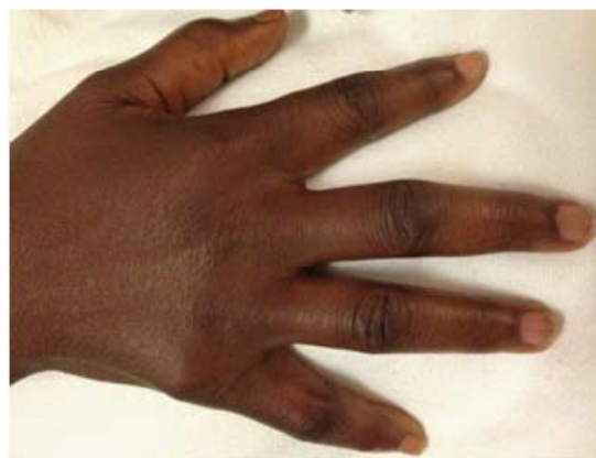
Figure 1. Early RA affecting the MCP PIP joints

A 23 year old female presented to clinic with a three months' history of pain, stiffness, and swelling of the proximal interphalangeal (PIP) joints, wrists, and knees. The symptoms began six months after the birth of her