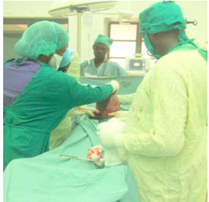
Figure 1. Lady with a uterus that had entirely herniated through the abdominal wall undergoing caesarean section

spinal anaesthesia, lack of drugs/equipment, Category 1 equivalent caesarean sections (e.g. umbilical cord prolapse, prolonged foetal bradycardia) or unstable patients (e.g. sepsis, severe APH).