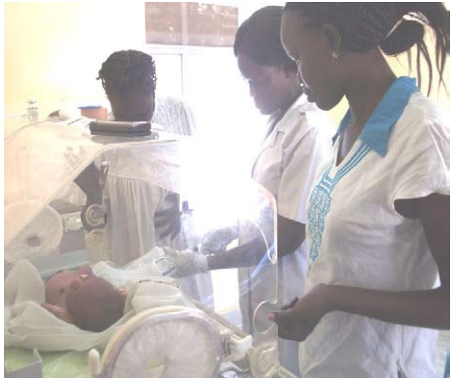
Figure 3. Baby born by caesarean section being cared for in the nursery at JTH

I thank the Anaesthetic and Obstetrics and Gynaecology departments at JTH for making me so welcome, the AAGBI (Association of Anaesthetists of Great Britain and Ireland) for their support, and TALC (Teaching-aids at Low Cost) and OAF (Overseas Anaesthesia Fund) for the textbooks.