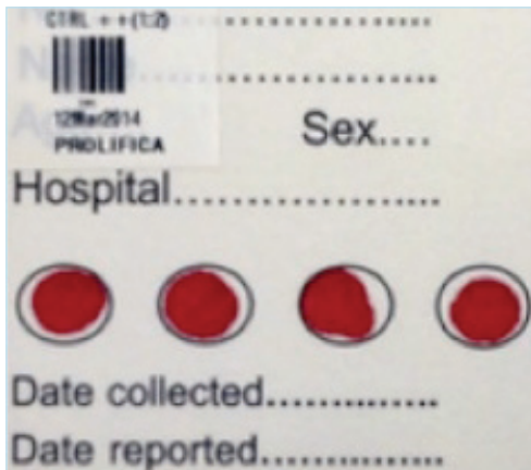
Figure 4. A filled Dried Blood Spot card