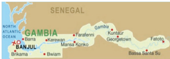
Figure 2. Map of The Gambia

West Africa and in particular, The Gambia, where it is present in over 90% of chronic carriers [10]. The clinical impact of this is yet to be elucidated.