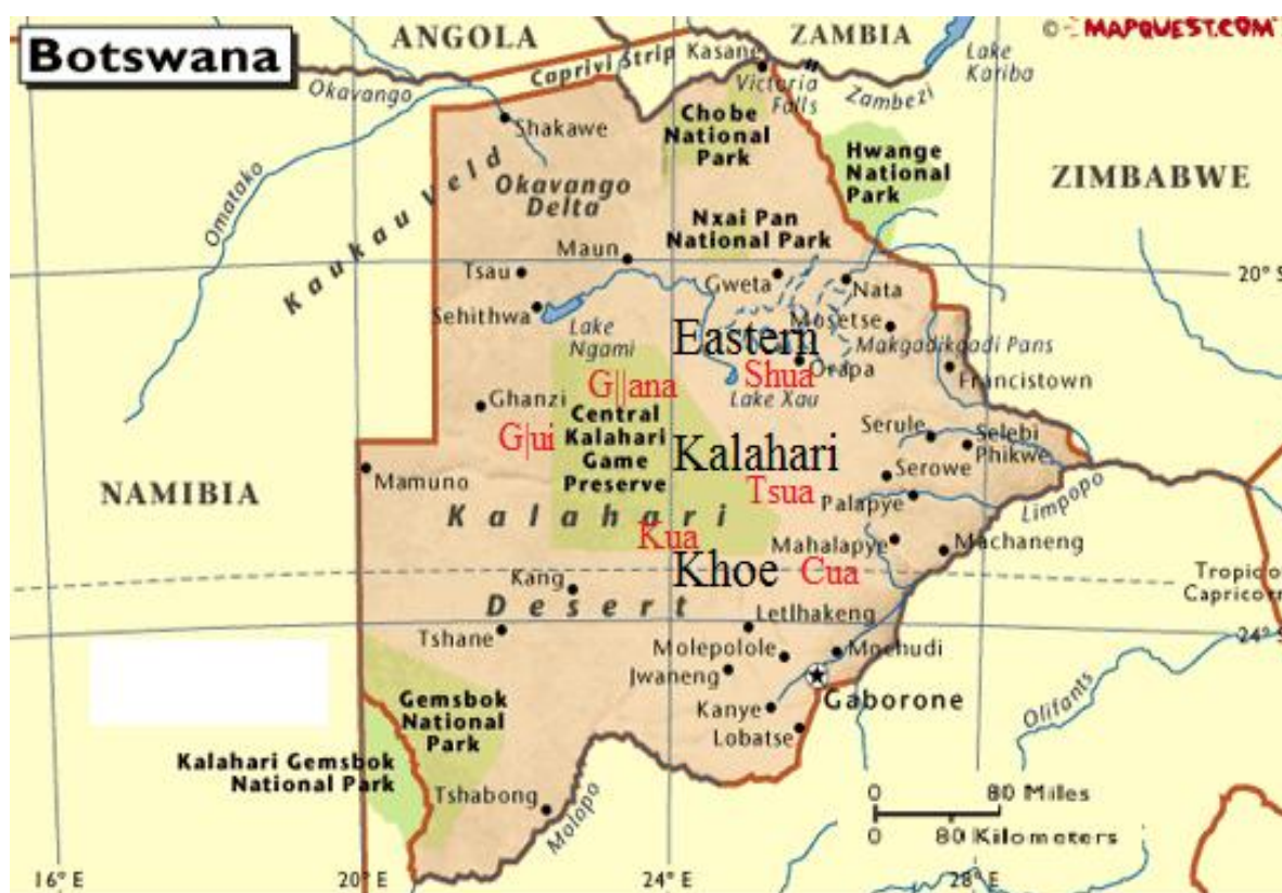
Figure 1. Locations of Eastern Kalahari Khoe languages (modified from MapQuest.com)

While Ethnologue provides these extensive location and variety details, there are nonetheless two critical observations that can be made: (i) there is no indication of the inter-relationship between the Shua and the Tsua (or Tshwa, perhaps further to the east), and (ii) there is clearly a geographical overlap in the distribution of these ethnic communities in the identified locations. In the following sections, these questions regarding linguistic relationships will be examined and some clarity provided. The map below helps to roughly locate the Khoisan ethno-linguistic communities under discussion. They are more or less located in the region of 24E and 28E longitude, and 20S and 24S latitude.