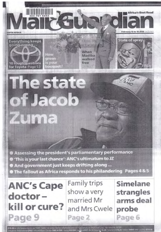
Figure 2. The front page of the Mail & Guardian on 12 February 2010

Figure 2, the front page of the Mail & Guardian of 12 February 2010, uses different images and captions to comment on Zuma's SONA: