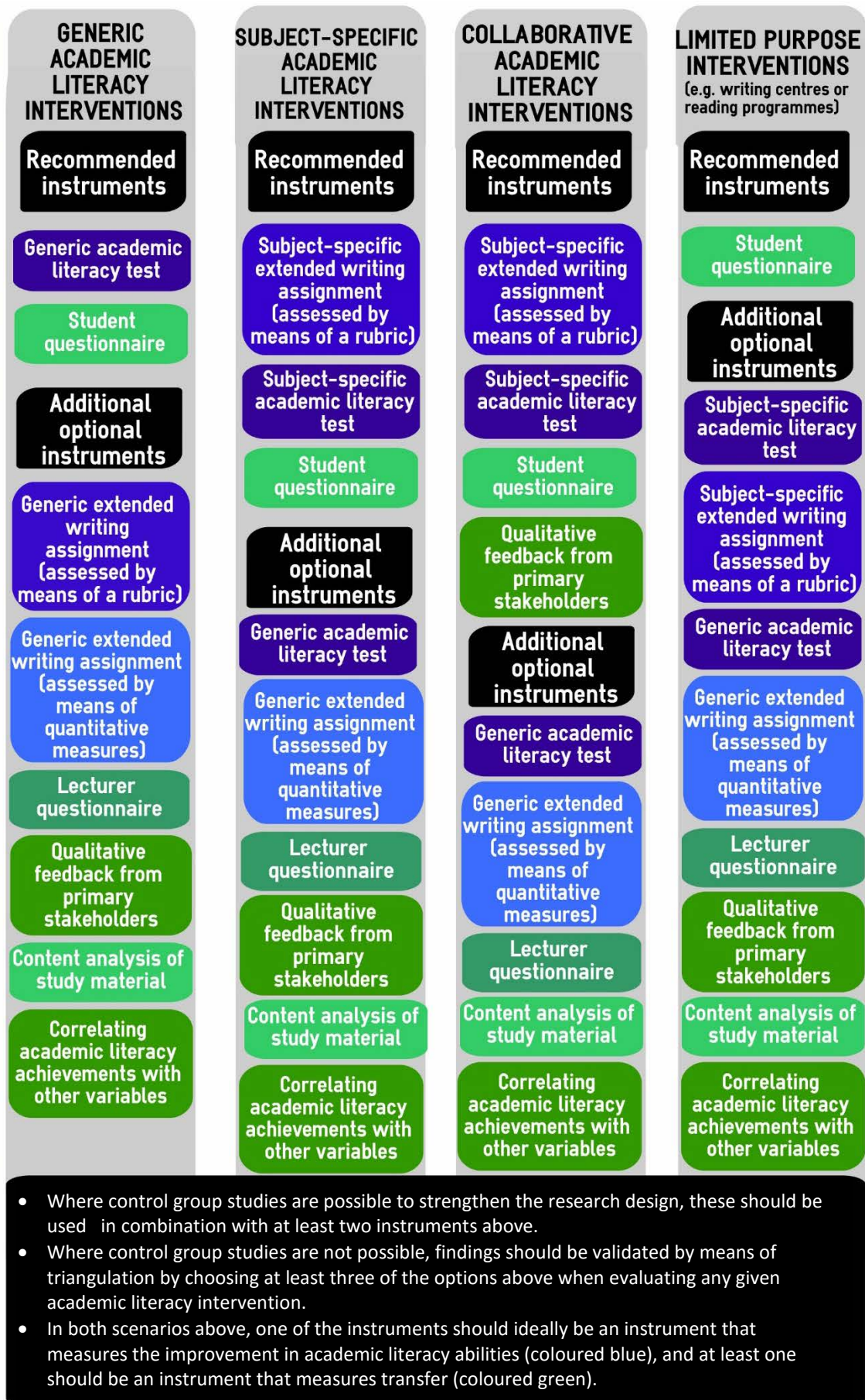
Figure 2: Proposed evaluation design for academic literacy interventions