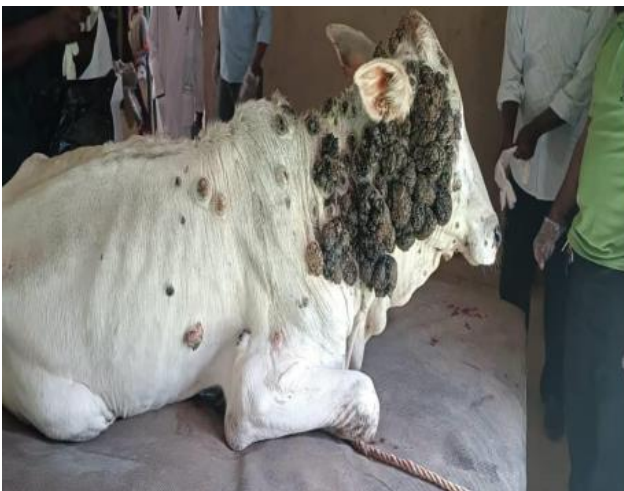
Plate I: A year old Sokoto Gudali heifer presented with cutaneous bovine papillomatosis

A year-old Sokoto Gudali heifer weighing approximately 80 kg was brought to the Veterinary Clinic Sokoto, Nigeria with complaints of head rashes that spread to other areas of the body (Plate I). The client claimed that the rashes were first seen three months before presentation.