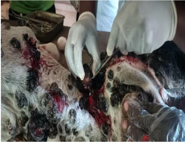
Plate III: Marginal resection of the tumor tissue from the skin of a Sokoto Gudali heifer

3 days was undertaken before the surgical technique to arrest the underlying secondary bacterial infection.