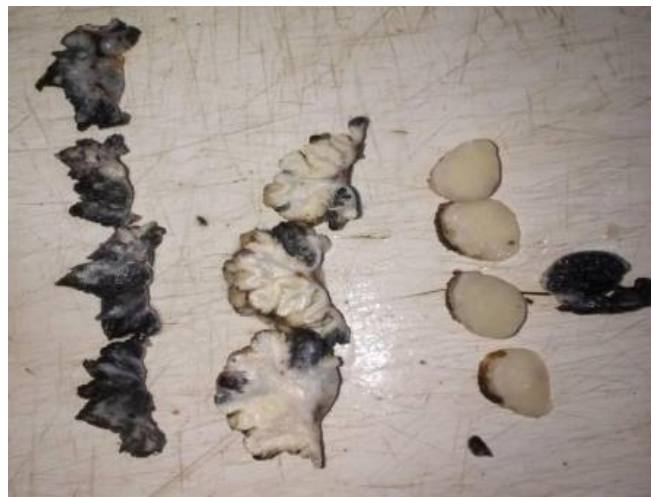
Plate II: Gross picture showing multiple irregular wart-like tissue from the skin of a Sokoto Gudali heifer

Presurgical Management: Intramuscular administration of amoxicillin (Amoxinject LA ® ) injection at the dosage of 0.1 mg/kg body weight for