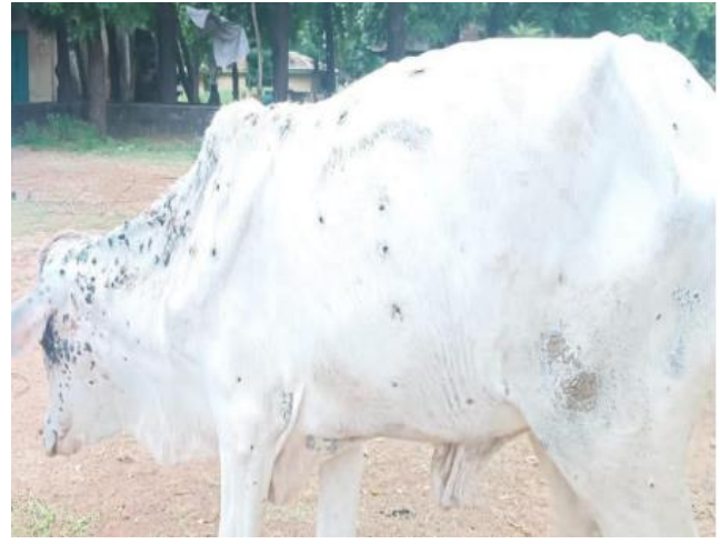
Plate IV: A Sokoto Gudali heifer two weeks after surgical removal of wart lesions

Histology sections showing areas of orthokeratotic hyperkeratosis, papillated epidermal hyperplasia (Plate