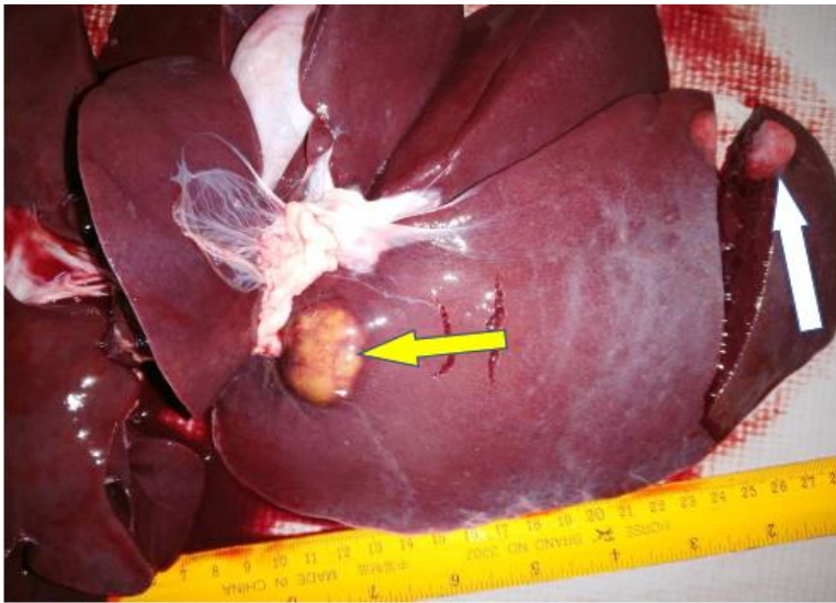
Plate I: Liver showing a cyst filled with clear mucoid fluid (yellow arrow) while the white arrow indicates a deep-seated nodule on the ventral aspect of the right lobe

The carcass showed moderate emaciation with pale oral, ocular and tracheal mucous membranes. The