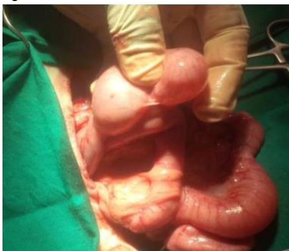
Figure 2: The large intestinal tract was exteriorized before measurement