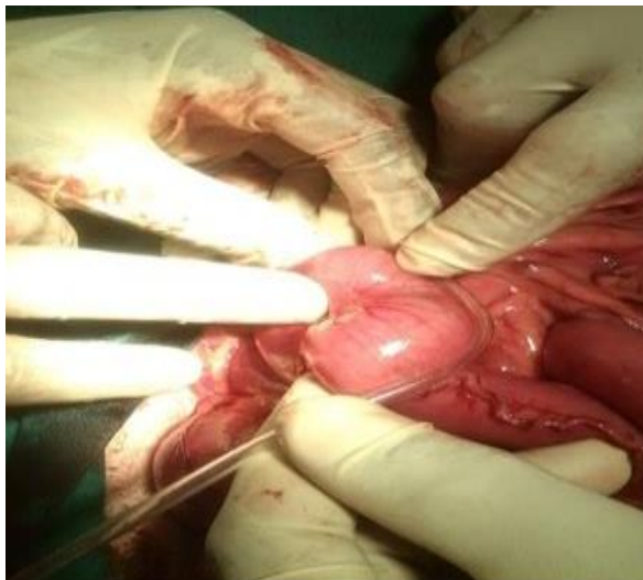
Figure 3: Measurement of large intestinal length using sterile drip set

intestine were identified. The thumb and the index fingers were gently inserted into the abdominal cavity and the large intestine was exteriorized and placed on laparotomy pads (figure 2). A sterile drip infusion set was used to measure the length of the individual segment of the large intestine beginning with the caecum, colon and rectum in that order; colon and rectum were measured together (figure 3). After each measurement, the drip set was placed on a calibrated metre rule to determine the length in cm. The large intestine was then gently returned into the abdominal cavity. The abdominal incision was closed in three layers. The peritoneum was closed with chromic catgut (Anhu Kangning Industrial Group, Co. Ltd, China gut) size 3-0 using a simple continuous suture pattern. The subcutaneous tissue was closed with a subcuticular suture pattern using chromic cat (Anhu Kangning Industrial Group, Co. Ltd, China gut) size 3-0 and the skin was closed with nylon (Pal Pharmaceuticals Ltd, China) size 3-0 using a horizontal mattress suture pattern. Ampicillin antibiotic (22 mg/kg) and pentazocine (3 mg/kg) were administered intramuscularly for 3 days respectively.