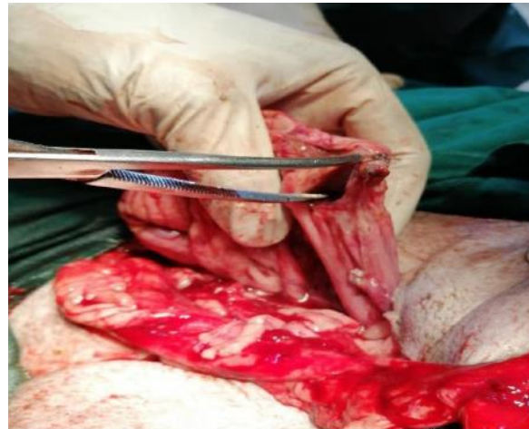
Plate II: Picture showing rip of the torsioned horn from the uterine body at the bifurcation