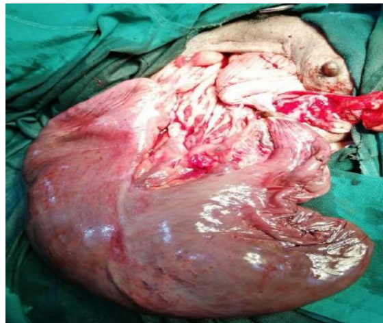
Plate III: Picture of the right affected horn after complete untwisting of the torsion

Surgical technique: The abdomen was accessed via a ventral midline abdominal incision from the umbilicus to the pelvic brim as previously described (Fossum, 2018). A volume of 2.1 litres of reddish-brown, foul-smelling, abdominal fluid was suctioned from the peritoneal cavity before the uterus could be adequately manipulated and exteriorized. A 2 cm point of rupture on the left non-gravid uterine horn