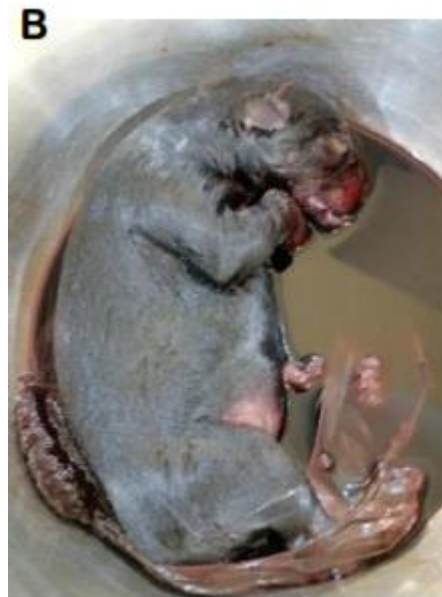
Plate IV: Picture showing evacuated foetal bag with detached placenta (A) and one of the evacuated foetuses (B)