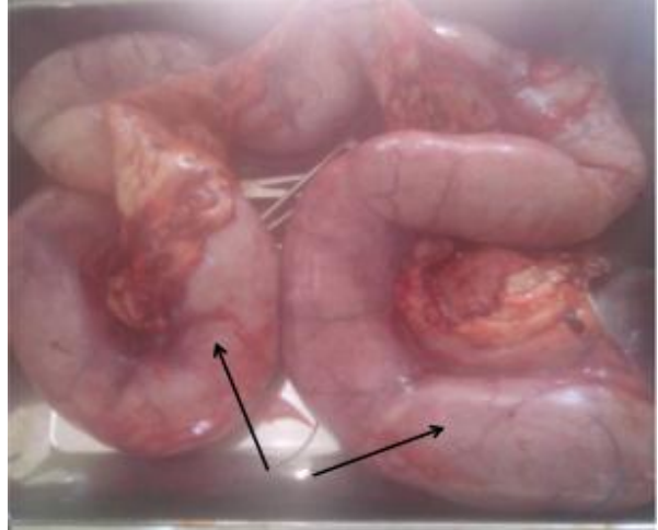
Plate II: Resected uterus from a seven year old Samoyed with closed pyometra with uterine horns distended with pus (arrows)