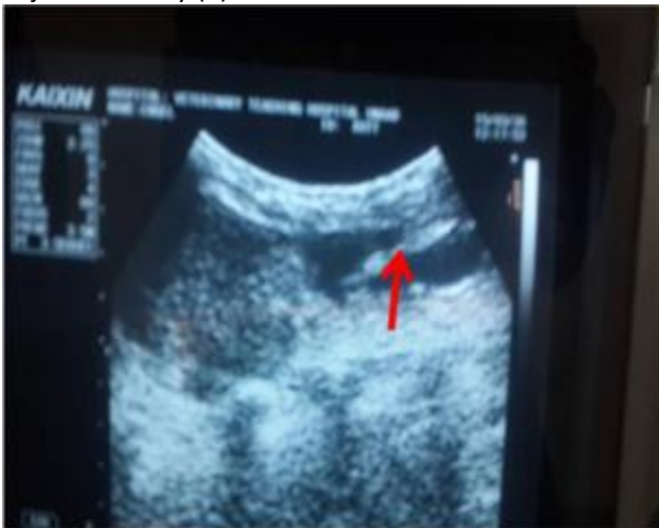
Plate V: Abdominal ultrasound of a five year old Rottweiler with intra-uterine foreign body (Arrow)