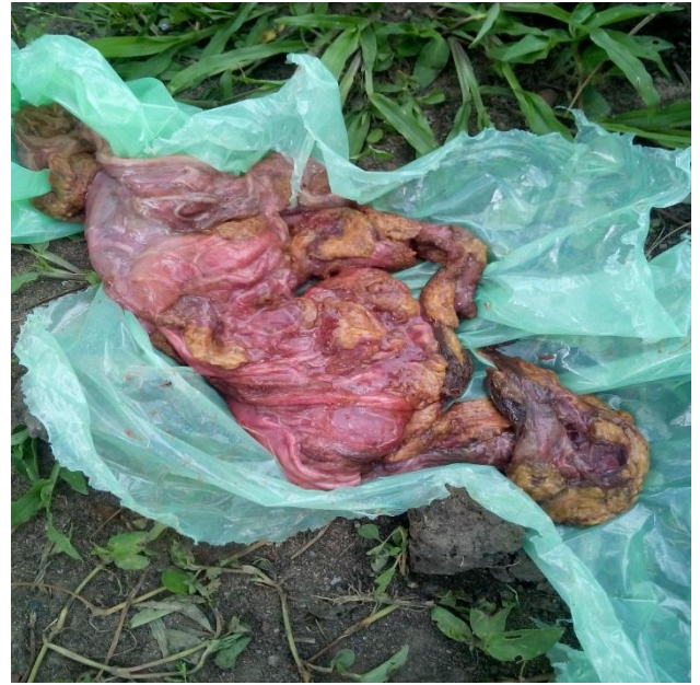
Plate II: A whole placenta after it was completely pulled out of the uterus