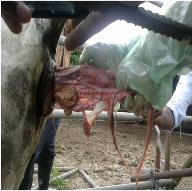
Plate I: Gradual traction was gently applied on the placenta hanging stump from the vulva