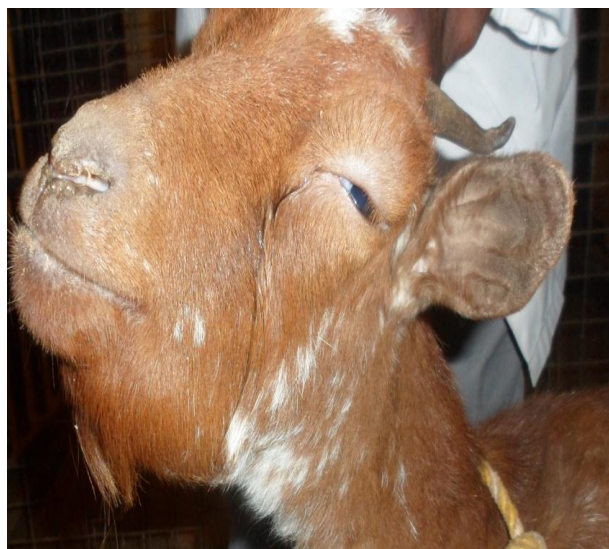
Plate I: showing puffy face and Submandibular edema

laboratories of the VTH for haemogramme and parasite screening respectively. The fecal sample was cultured for two weeks using the Baermann’s technique to obtain third stage larvae; these larvae were collected for further identification. The animal was treated after one week of presentation using Albendazole suspension at 7.5mg/kg live body (once) and 400 ml of whole blood was collected from a healthy buck in the goat pen of the faculty and was transfused intravenously. The donor buck weighed 30kg and screened for haemoparasites and other infectious agents like brucellosis. Four hundred milliliters of blood were drawn from the donor in a blood bag containing citrate phosphate and immediately transfused very slowly for the first 30 minutes through a blood filter set and sterile jugular catheter, after which the rate was increased due to absence of any adverse reaction. The hematological parameters were re-evaluated 2 days after the transfusion; and it was observed that the packed cell volume and the hemoglobin concentration showed some improvements (Table 2).