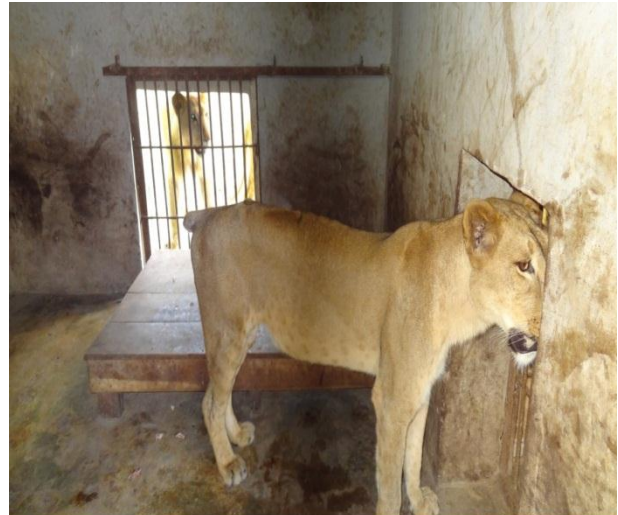
Plate III: Lioness post operation.

Africa (Packer et al. , 2013). Their threat in the wild have been associated with indiscriminate killing (to protect human life and livestock) and prey base depletion, habitat loss due to human activities (Bauer et al. , 2015), and poaching leading to suggestion of fencing of conservation areas (Packer et al. , 2011, Packer et al. , 2013).