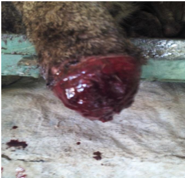
Plate I: Lioness tail showing wound before surgery

The animal was brought out of the restraint cage into a clean compartment earlier prepared for animal comfort and to prevent possibility of injury that may result from recovery episode with the restraint cage. Cephalexin, 10mg/kg every 12 hours (Dowling, 2010), incorporated in food bit was administered for five days post surgery. The tail wound was also covered with honey as earlier described (Eyarefe & Oguntayo, 2012, Eyarefe et al. , 2012). The wound healed uneventfully and sutures were removed three weeks later when the lioness could be lured into the restraint cage under chemical restraint with xylazine–ketamine combination.