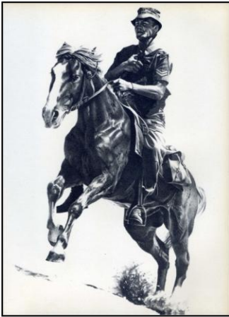
Figure 4: Boer blood

Badcock's caption to this sketch, " Across the pans " (fig 5), refers explicitly to the "extraordinary bond between horse and rider", capturing a genuine emotion undoubtedly, but also sentimentalizing and thereby glossing over the inherent violence of that which he depicts.