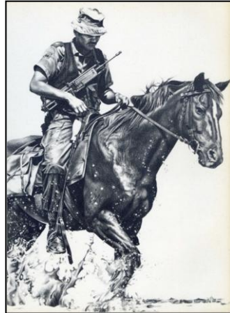
Figure 5: Across the Pan

The horse's relative silence, heightened sensory perception, terrain-versatility and speed proved more useful in certain contexts than the foot soldier and armoured vehicles. The ultimate goal of mounted infantry units stationed in SWA was to patrol, track and kill SWAPO insurgents' crossing over the Angola-Namibia frontier. The dynamic internal challenges to the state presented an altogether different application of mounted infantry, which was to see its role change radically from one whose sole raison d'être