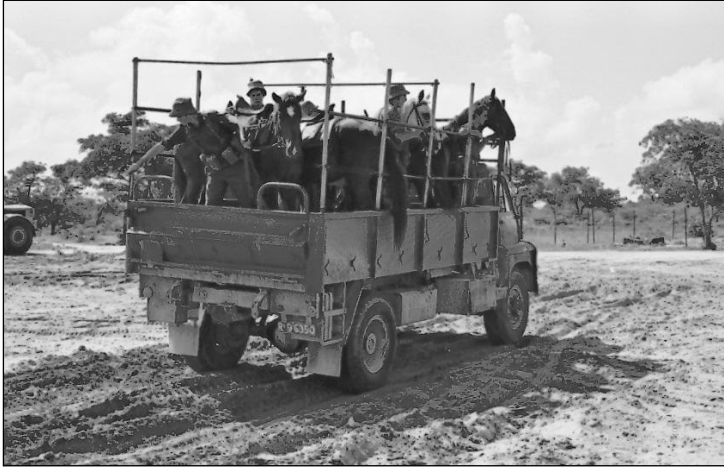
Figure 2: An improvised Bedford Horse transporter truck carrying horses and riders to their patrol jump off point [ Image: 761005999, SADF horse mounted infantry transported in Bedford truck.]

left behind to determine the numbers, physical fitness and capability of SWAPO fighters crossing the frontier. 69