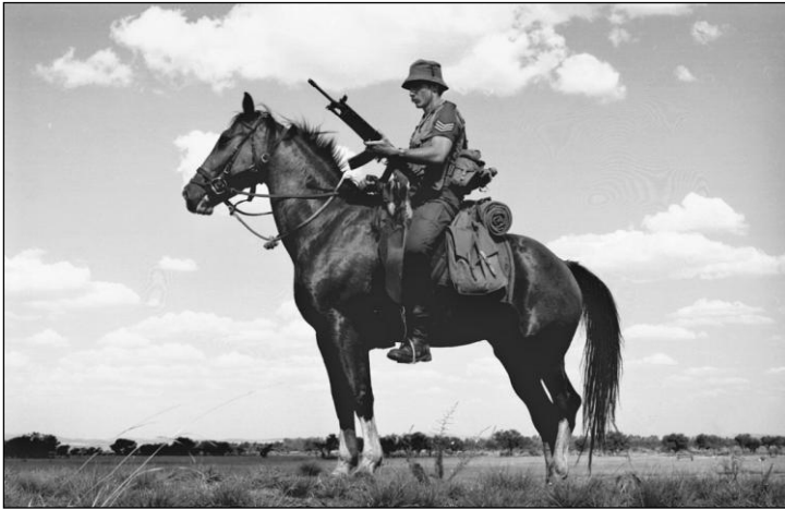
Figure 1: Mounted sergeant in full patrol kit, webbing, saddle bags, sleeping bag, and R4 rifle.