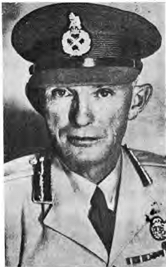
Maj Genl Dan Pienaar

Afmadu, after heavy shooting, was occupied by FOWCOL on 11 February. 4 Field Brigade moved during the night to Mido area. On 13 February the unit arrived at Eyedera. The importance of a quick crossing of the Juba River and the overrunning of Jumbo was stressed at a conference of the various Commanding Officers.