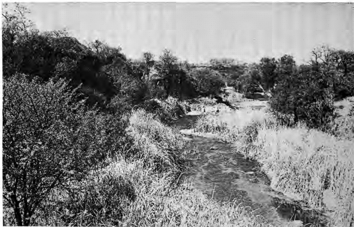
Both Brinks mention the thick bush. This scene is just north of the Langberg. (Photograph taken in 1974)

position in a water furrow between the river and the knoll A .