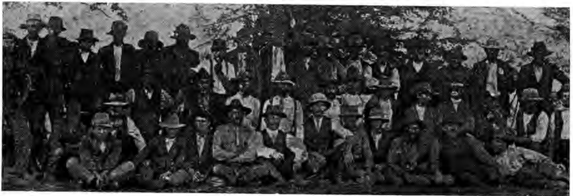
Members of the Rustenburg Commando, 1914

General Beyers arrived with his commando at the farm Commissie Drift, six miles south of Rustenburg, on 25 October 1914. Here he was attacked by General Botha on the 27th, and taken by surprise. 1 Beyers' com-