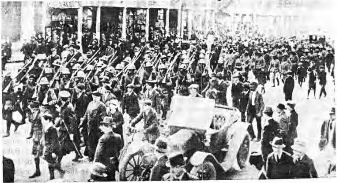
Contingent of Union forces marching through Cape Town after the successful conclusion of the South West Africa Campaign. Non-European drivers can be seen at the rear of the column.