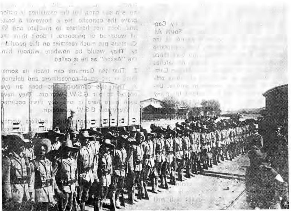
German South West Africa: German Native Corps officered by Europeans.

town they will give some attention to the units which only flourished in wartime. Commandos or Defence Rifle Associations did valuable service in the Great War both in the field and at home. Our modern commandos are their direct descendants and can be proud of their ancestry. Whilst it is understandable that Cape Town should have its own Defence Rifle Association, it will probably come as a surprise to inhabitants of Claremont, Rondebosch and Wynberg/Constantia to know that each of these suburbs also had one.