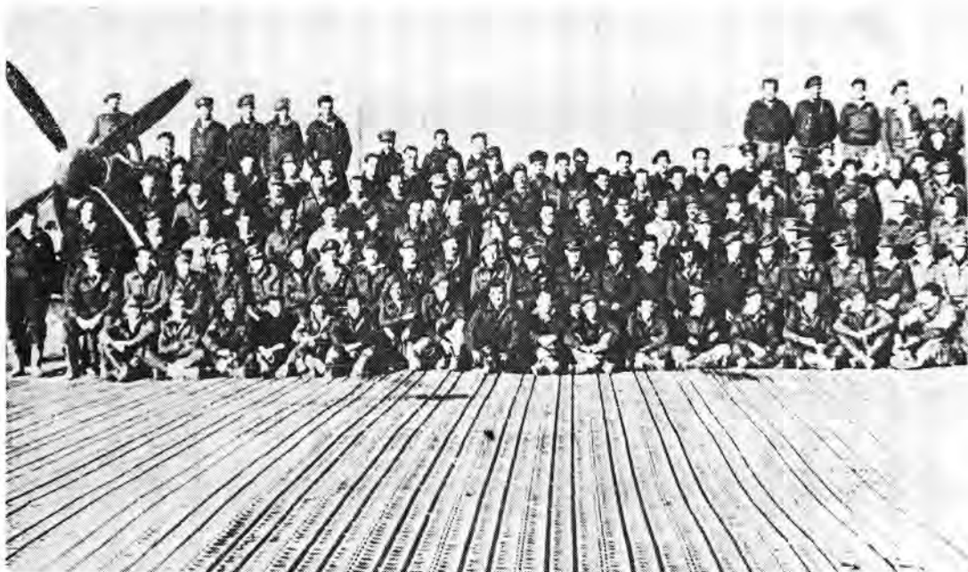
7 Squadron's Personnel 1944