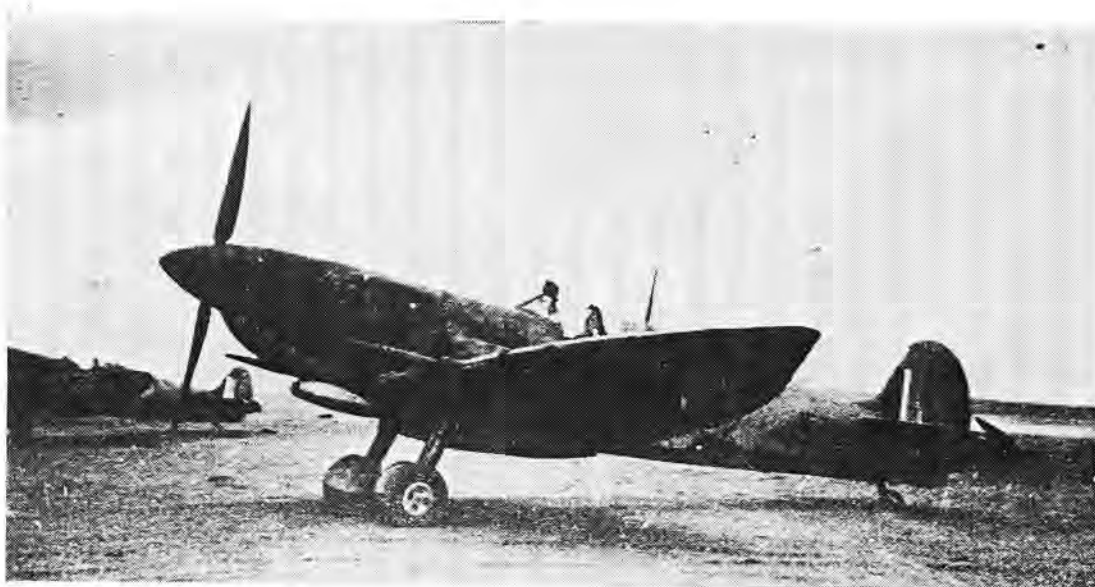
Spitfire Mk VIII

The rest of September was spent on bombing missions. 53 missions were flown against buildings, guns, flak positions, dumps, railways, bridges, headquarters and tanks. Forty direct hits were recorded on buildings, 10 on roads and one on a bridge. Only 5 MT were