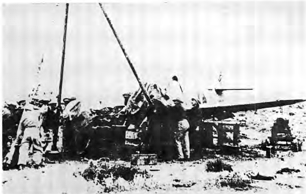
ME 109 salvaged at Mersa Matru

Two days later news was received over the radio that Kos was being attacked by German