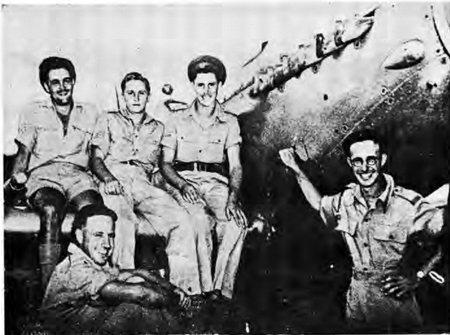
Groundcrew with a Spitfire. Note the 20mm gun

On 27 August orders were received for the Squadron to move to El Gamil airfield at Port Said.