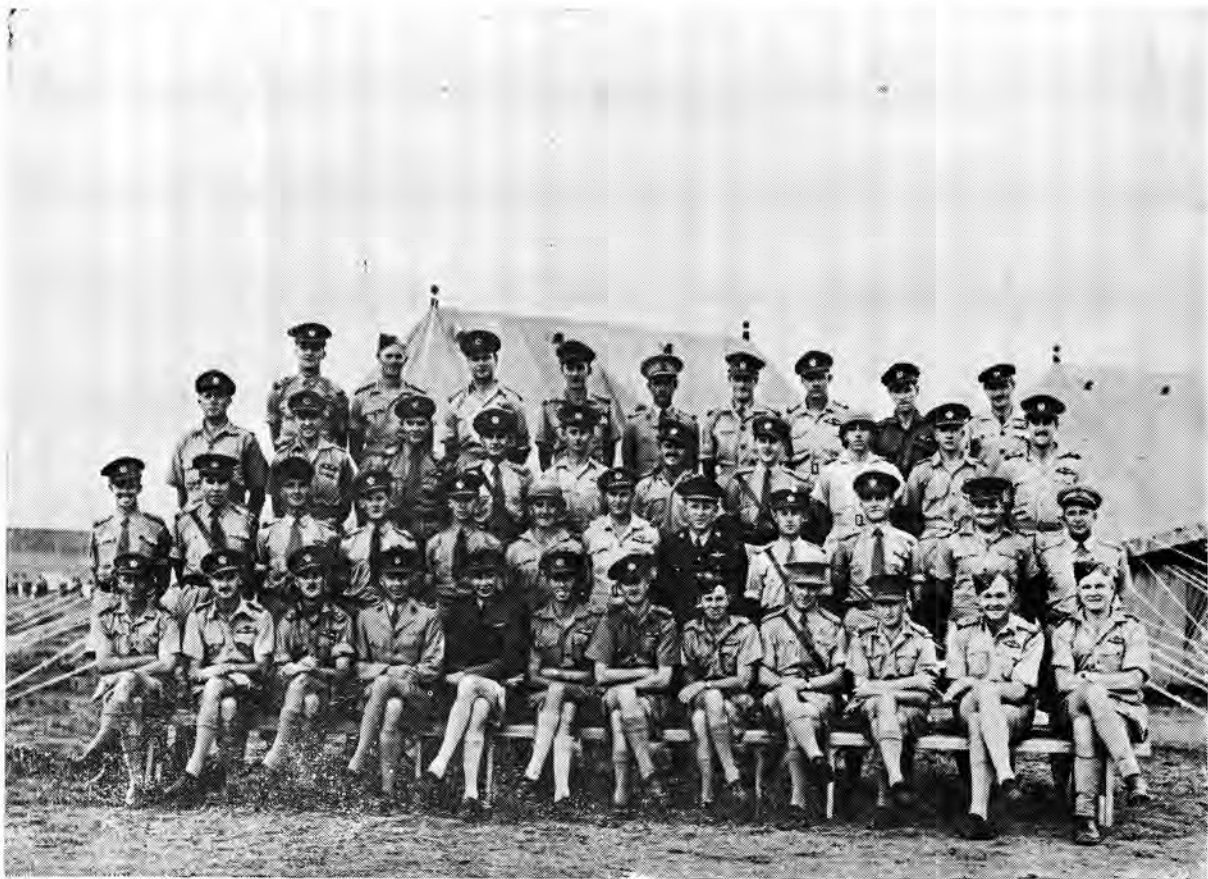
Members of 7 Squadron in World War II