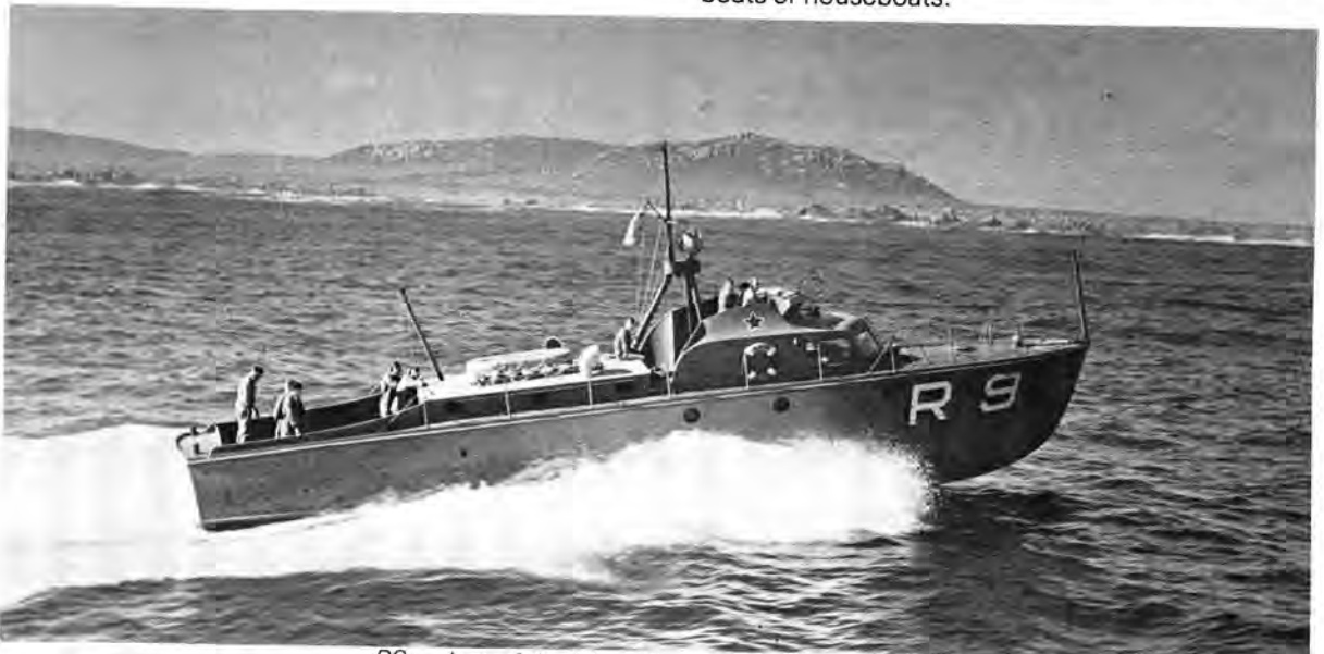
R9 – last of the Miami boats to leave the service.

Many of the boats became fishing boats, pleasure boats or houseboats.