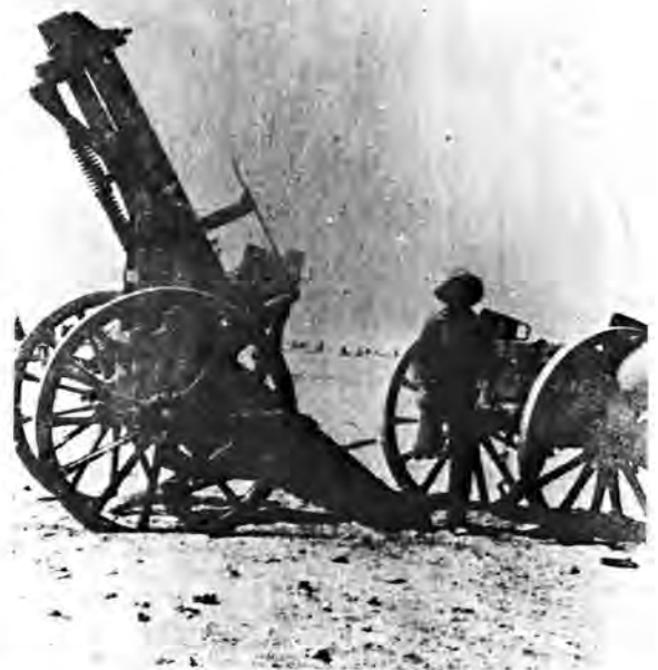
The 'Skinny Liz' manufactured at Fort Knokke.

For many years 'Skinny Liz' and the other Gransden gun stood outside the Wynberg Officers' Club. In 1976 'Skinny Liz' was moved to a place of honour at Youngsfield to serve as an inspiration to our present day 'ack-ack' gunners.