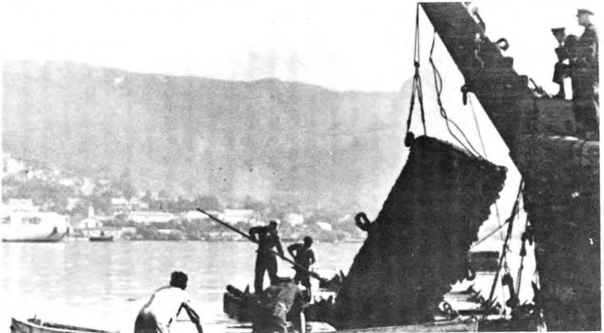
Mine-laying activities: top — Laying out nets prior to attachment to boom baulks; centre — section of Saldanha Bay boom; bottom — boom maintenance party at work.