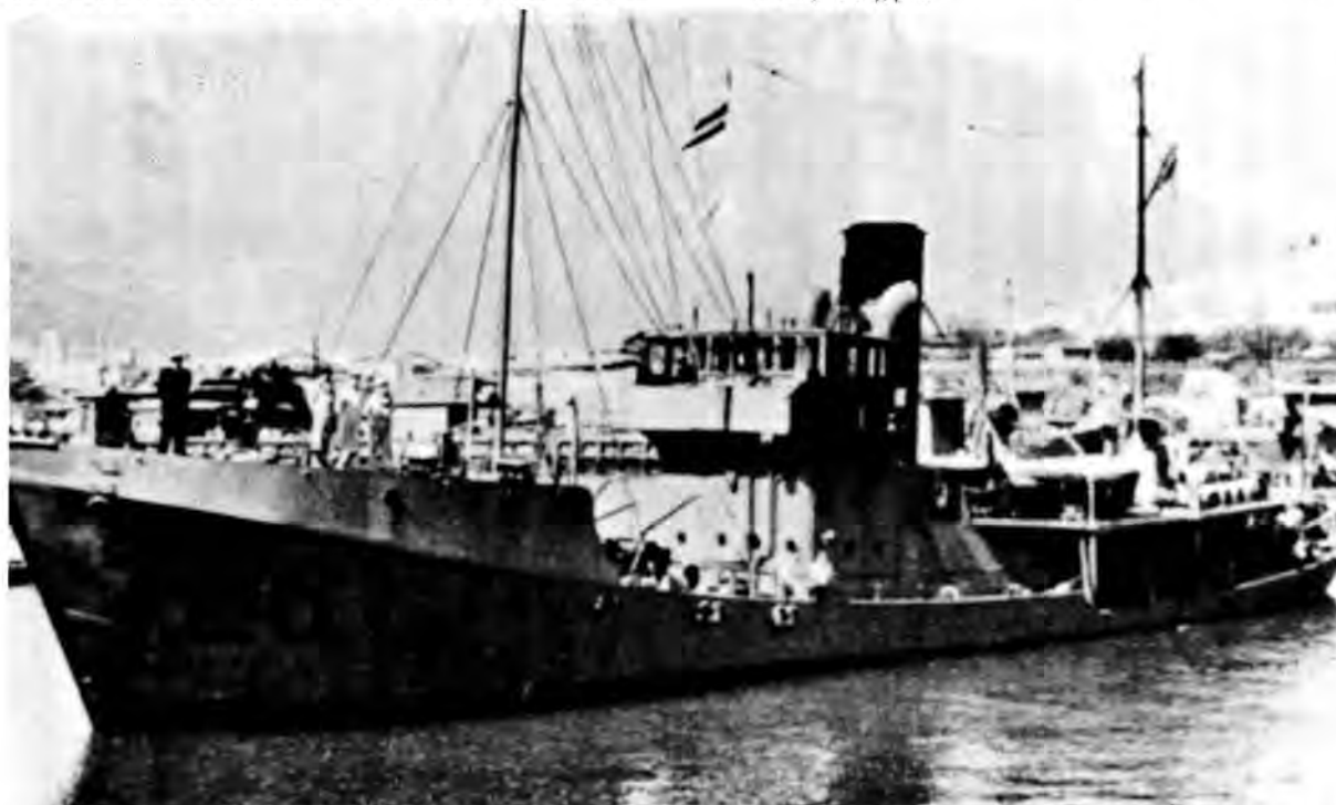
The A/S whaler, HMSAS Southern Floe, in Table Bay harbour. She was lost in the Mediterranean on 11 February 1941.