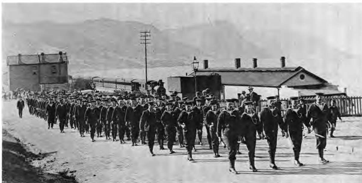
South African Royal Naval Volunteer Reserves marching through Simonstown after the outbreak of World War I.

Much has been written about the South African sailors who served during World War II. Nonetheless, there are a number of episodes about which one would like to learn more. Not enough is known about the South Africans who served in the Royal Navy and other navies. The best known South African to serve in the Royal