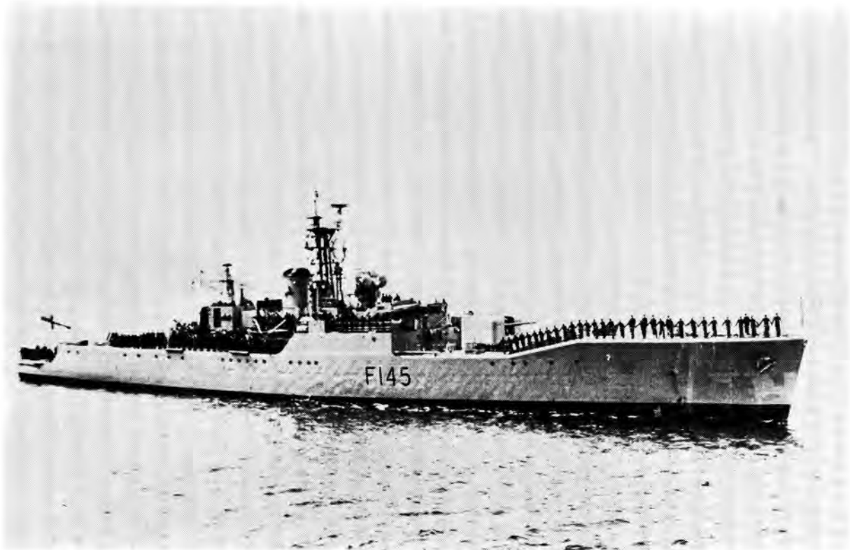
SAS PRESIDENT PRETORIUS, one of SAN's President-class frigates which may be scrapped in terms of the new naval strategy forced on South Africa.

In fact, viewed from the perspective of 1979 the isolation of SA militarily seems complete. No Royal Navy ships have called at Simonstown since 1974. South Africa's ability to patrol the Cape Sea Route, meanwhile, received an irreversible blow in the form of a comprehensive UN arms embargo against the Republic in November 1977.