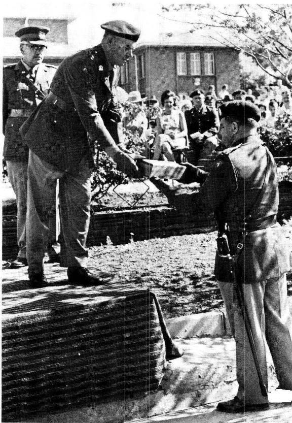
Die Vryheid van die dorp word aan die Kuruman kommando toegeken.

In Europe the sword would appear to have been developed from the knife in Minoan Crete and Celtic Britain at about the same time between 1500 and 1100 BC, the period known as the