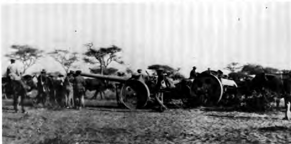
SA Horse Artillery with Guns in South West Africa

After the cessation of hostilities, a number of far-reaching changes in the administration of the Defence Force took place. Purely military policy had formerly been directed by the Minister through the Secretary for Defence but in 1918 the responsibility for the co-ordination of all mili-