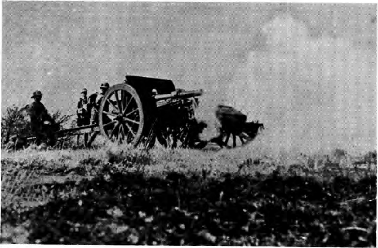
Artillery Training in South Africa

the District Mounted Police of the Cape Colony, the Natal Police, Transvaal Police and Orange River Colony Police. 13