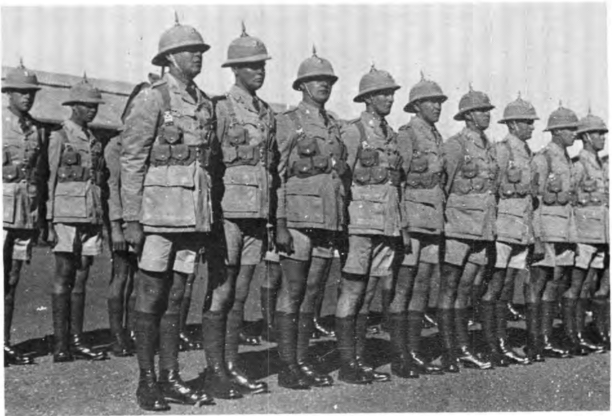
Members of the Special Service Battalion on Parade