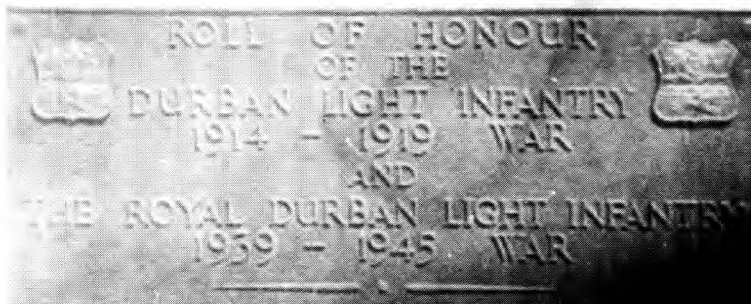
The church showing the roll of honour of both wars of the Durban Light Infantry and the Royal Durban Light Infantry. (761003221)