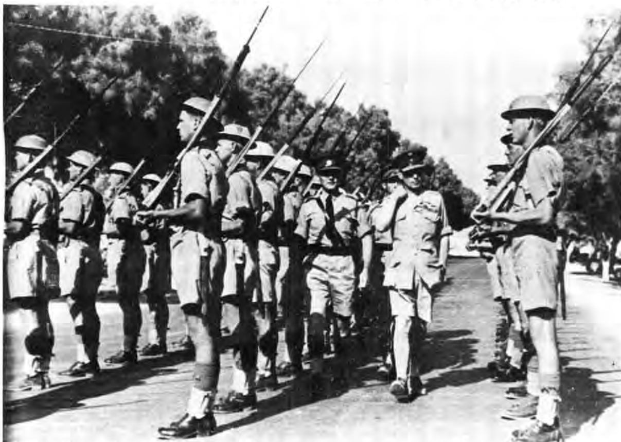
The King of Greece inspecting SA Troops at Mersa Matruh consisting of troops of 1 Transvaal Scottish, Cape Town Rifles and Royal Natal Carbineers. (7610001536)

Quicker into action than most they held their first official training parade within 6 weeks, on 2nd October, 1857, complete with two 6 pdr brass guns. Five days later they were present at a Volunteer Review at Stellenbosch.