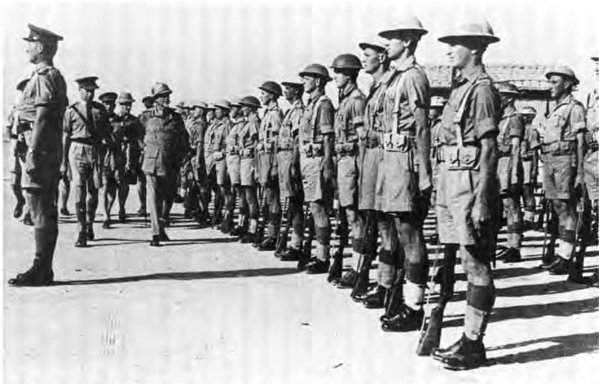
Gen Smuts visiting 1 SA Division. Inspecting guard of honour at Mersa Matruh. Detachments from Cape Town Rifles, Royal Natal Carbineers are included (76100152)