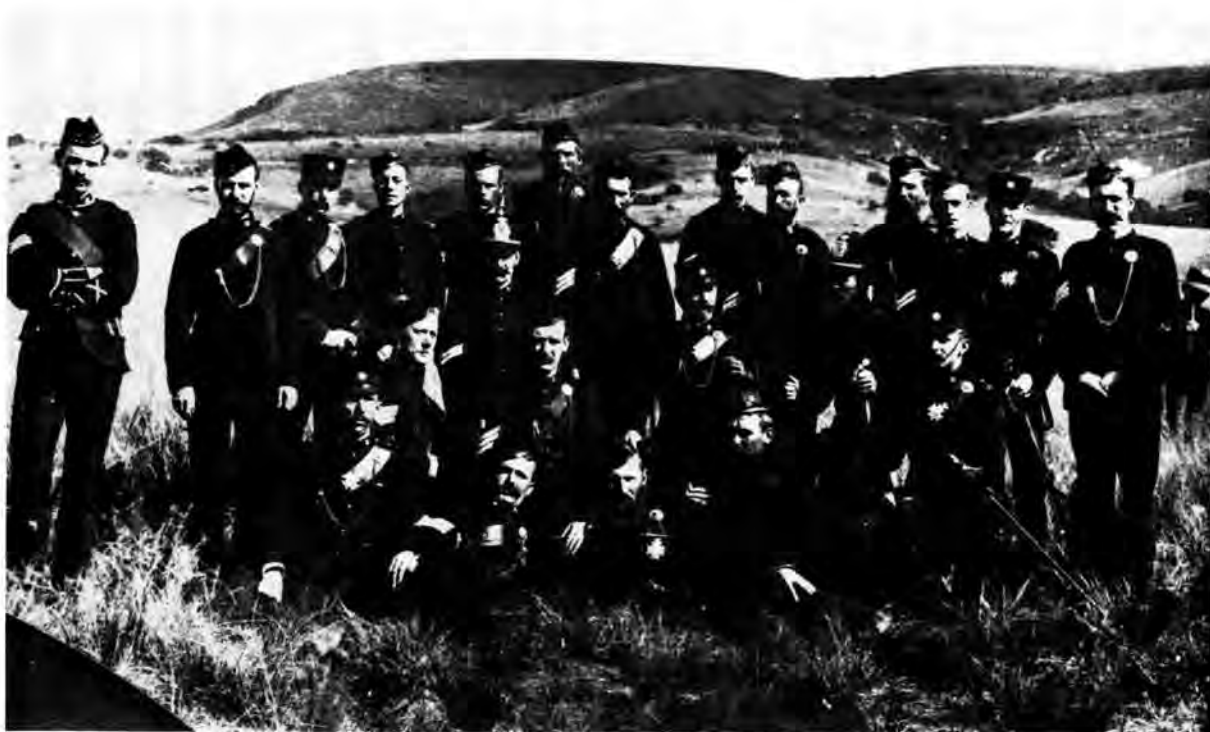
The officers and Non Commissioned officers of the Royal Rifles (left half) Pinetown Camp, 1890. (841003489)

bers of the former Durban Volunteer Guard, met on 4th March, 1873, and decided to proceed with the organisation of a Corps. Names were taken and a second meeting was held on Saturday, 15th March for further enrolment.