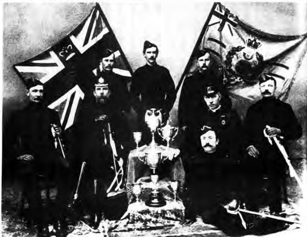
Officers of Prince Alfred's Guard 1899. The Queen's and Regimental colours are in the background. (841003490)