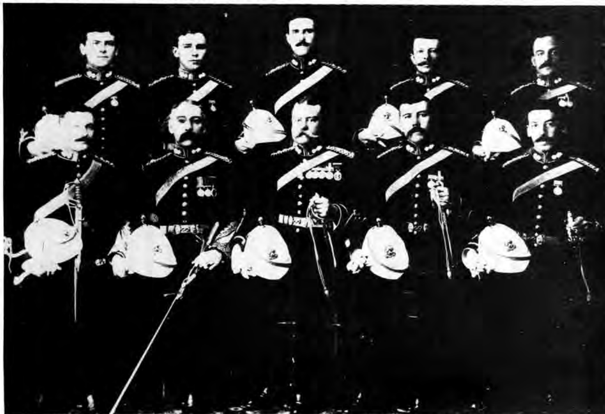
Officers of Prince Alfred's own Cape Field Artillery 1907.