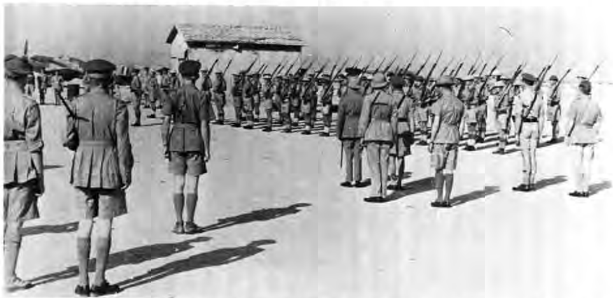
Gen Smuts leaving Mersa Matruih. Guard of honour at the Airfield with detachments of 1 Transvaal Scottish, Royal Natal Carbineers and Cape Town Rifles. (761002121)

In Natal we find the date of a letter being used (Natal Carbineers) and, apparently, the enrolment date of a previous unit, as is shown in the table below: