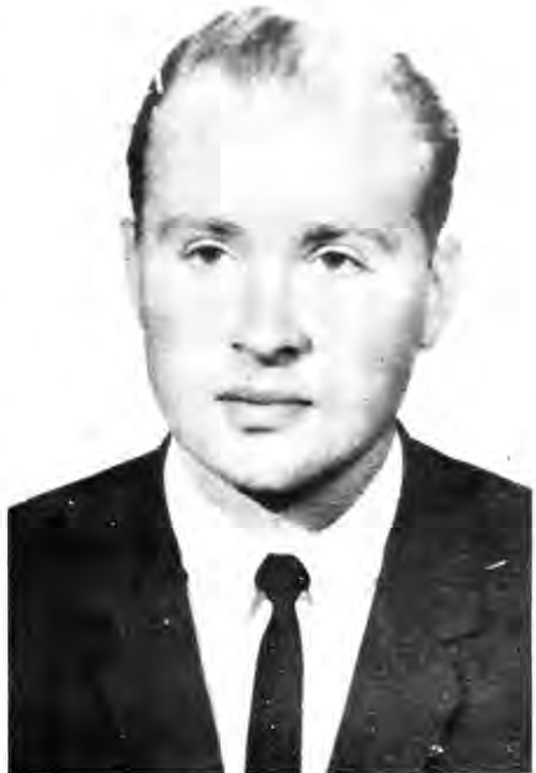
Yuri Loginov, a Soviet KGB agent captured in South Africa in 1967. He was later exchanged for 10 West German agents in East Germany

'Sleepers' – so-called because such trained agents are infiltrated into target-countries, ordered to establish a local presence by becoming assimilated inconspicuously as professional or businessmen for a number of years, before the order comes from Moscow to 'awaken' them for specific tasks of espionage or sabotage – are given exhaustive instruction in the language, customs, religious practices, sporting preferences and at least two different types of trade or