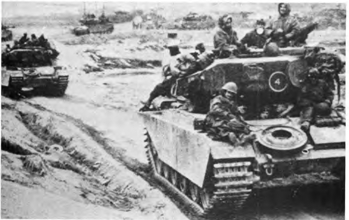
Korea 1950. Centurion Tanks of the 8th Hussars