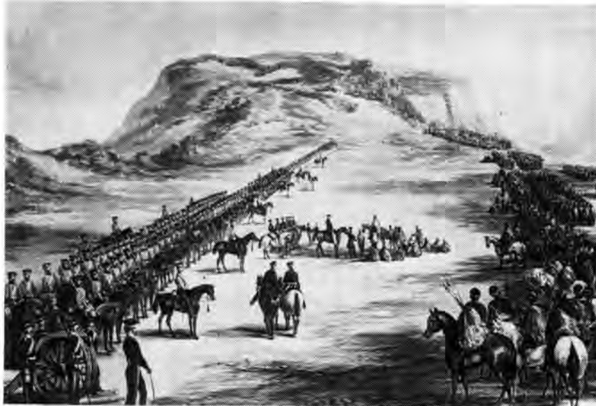
The meeting of Sandili and Col John Hare at Black Drift, 30 January 1846

Xhosa for the theft of an axe led to an attack on a patrol, the invasion of the colony and cattle raiding. Mfengu (Fingo) irregulars aided the colonial authorities but only after a protracted and bitter "scorched earth" campaign did the Xhosa submit.