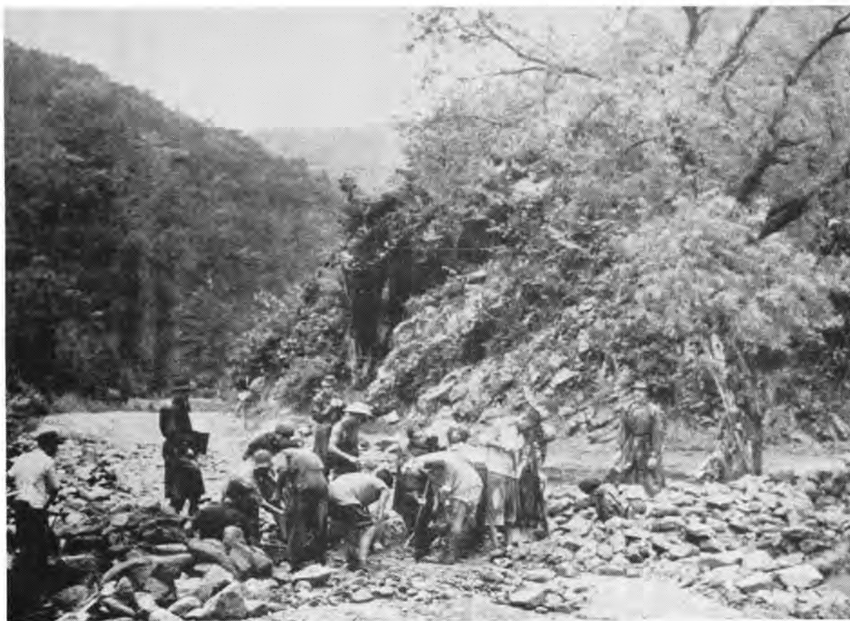
Korea Jun–Nov 1950. Repairing a road near Imjin River