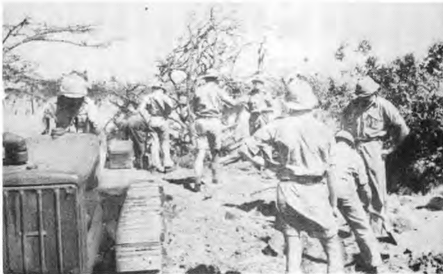
South African Engineers clearing a landing field on the Kenya Border early 1941