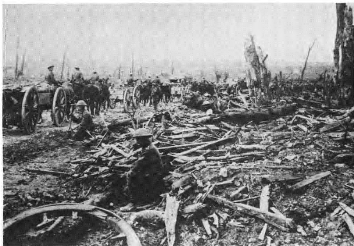
Field Guns moving up through Delville Wood, 15 September 1916