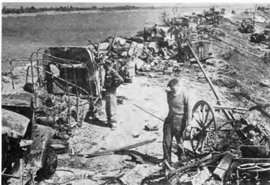
Strewn along the banks of the Po were hundreds of enemy vehicles of all descriptions destroyed by air attacks, fire from artillery and tanks on by the enemy himself during his retreat

The 6th Armoured Car Division left for Italy in April 1944. Served until May 1945 when the German forces surrendered. Suffered 5 176 casualties.