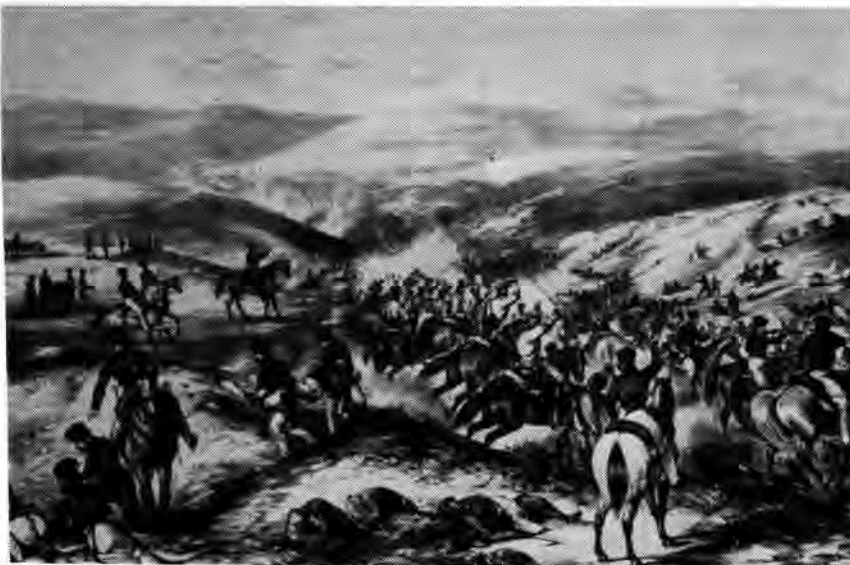
The Battle of Gwangwa, 8 June 1846

By 1830 the Cape's eastern frontier lay along the Keiskamma River. Whites, Khoikhoi and Xhosa were once again living in the border territories and insecurity and tension persisted. The vacillations of government policy added to the uncertainty and bitterness among the Xhosa. Large scale cattle thefts were followed by harsh military reprisals and at the end of 1834 a large force of Xhosa swept into Cape territory. After extensive military operations the invasion was defeated and the newly-named Queen Adelaide districts temporarily annexed to the colony.