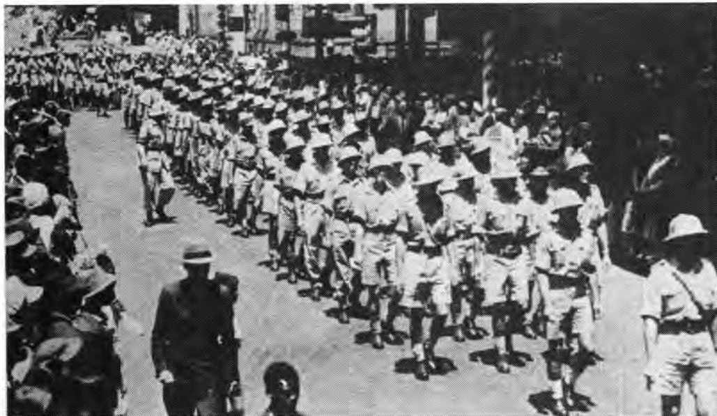
South African troops marching through Cape Town on their return from Madagascar, the occupation of which during the latter half of 1942 represented the only active operations undertaken by the SA Infantry Brigade Group, which was part of 3rd SA Division

On 25 June 1942 the South African regiment arrived at Diega Tuarey and supported the Allied effort until 2 November 1942. The Union Defence Forces suffered 18 casualties.