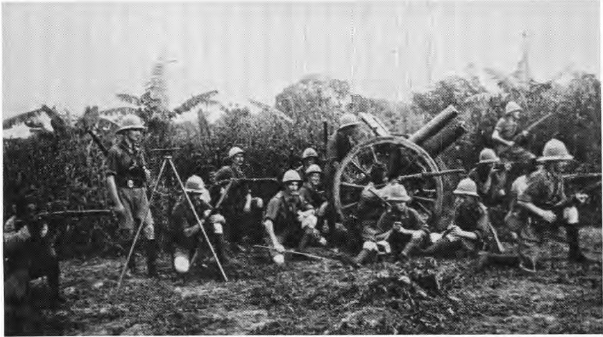
Troops and Howitzer canon: South West Africa 1915