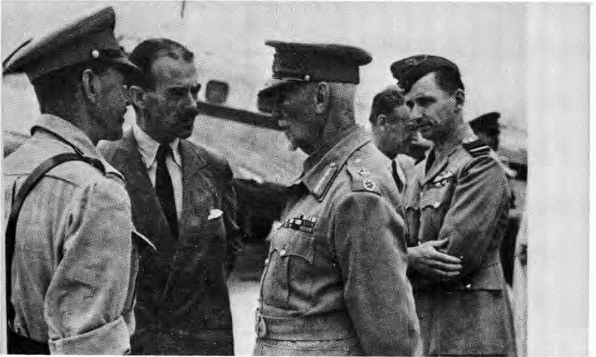
Gen the Hon Sir Harold Alexander, C-in-C, Middle East in succession to Gen Auchinleck, the Rt Hon R.G. Casey, Field Marshal Smuts and Air Chief Marshal Sir Arthur W. Tedder, Air Officer C-in-C, Middle East

2 Squadron participated as part of the United Nations forces in Korea against the Chinese Communists.