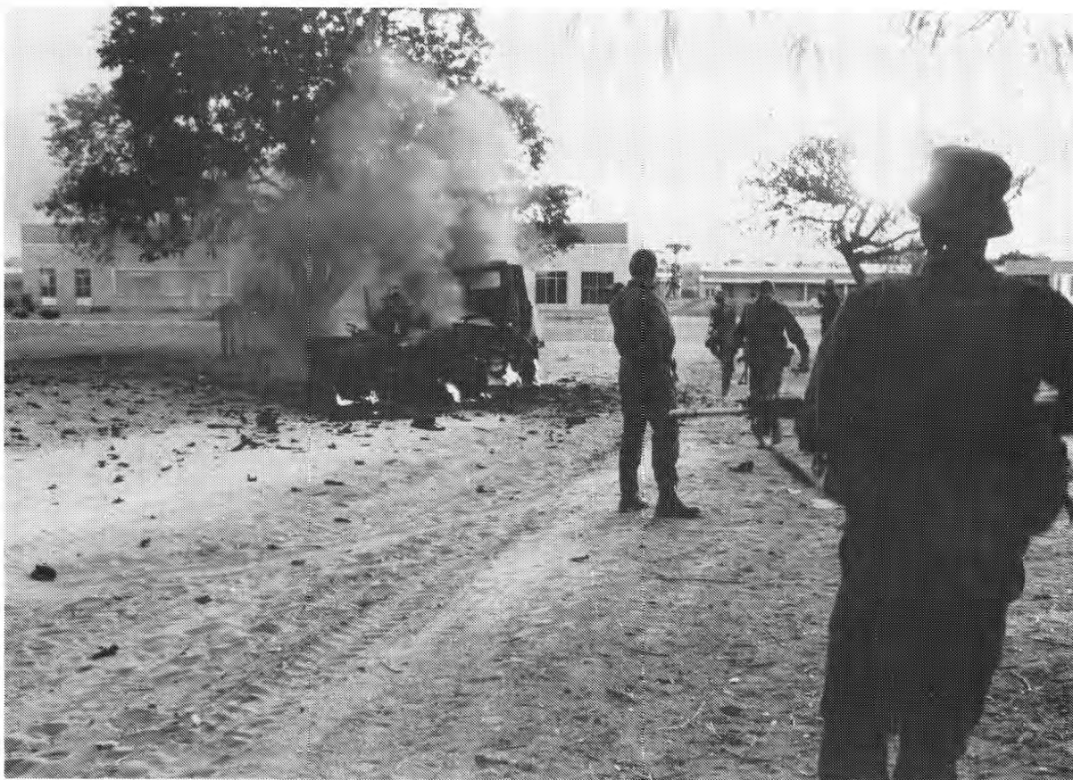
South African Soldiers in Angola