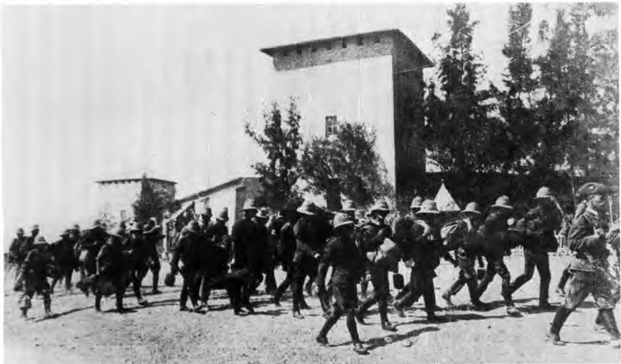
Troops take control of a town in South West Africa: 1914

fence Forces defeated the German Schultztuppe. The campaign started in September 1914 but was hampered by the Rebellion, and in January 1914 it was restarted. It continued until 9 July 1915 when the German forces surrendered.