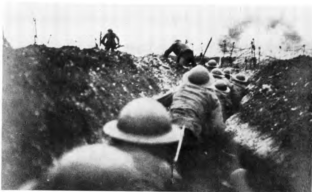
Trench war in France during the First World War

unit suffered some 1 400 casualties. Of all the battles fought "Delville Wood" is the one best remembered.