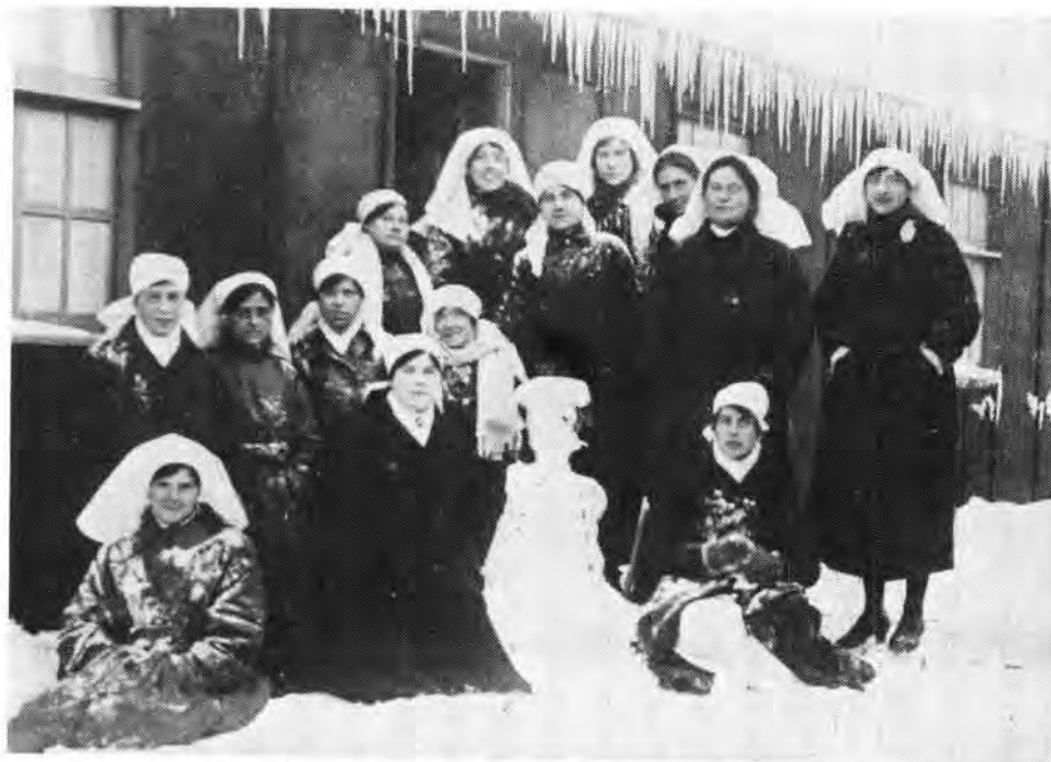
South African nurses in France during the First World War

• races volunteered to serve in East Africa and Palestine.