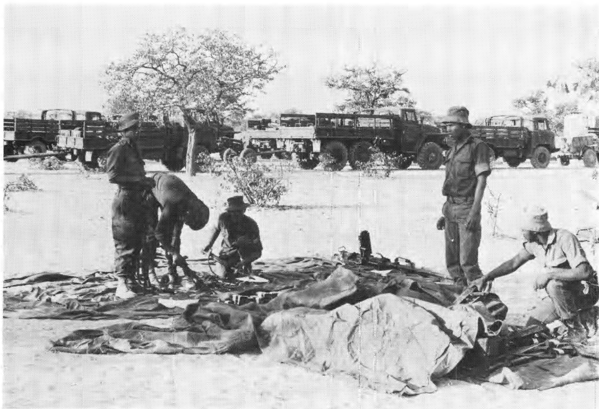
South African Soldiers in Angola