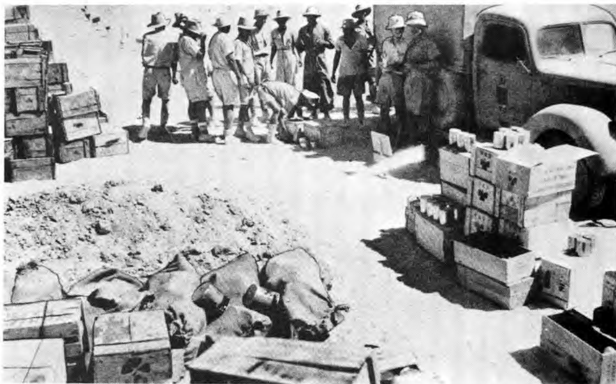
Cape Corps and Native Military Corps men help unload boxes of cheese and other rations in the Western desert