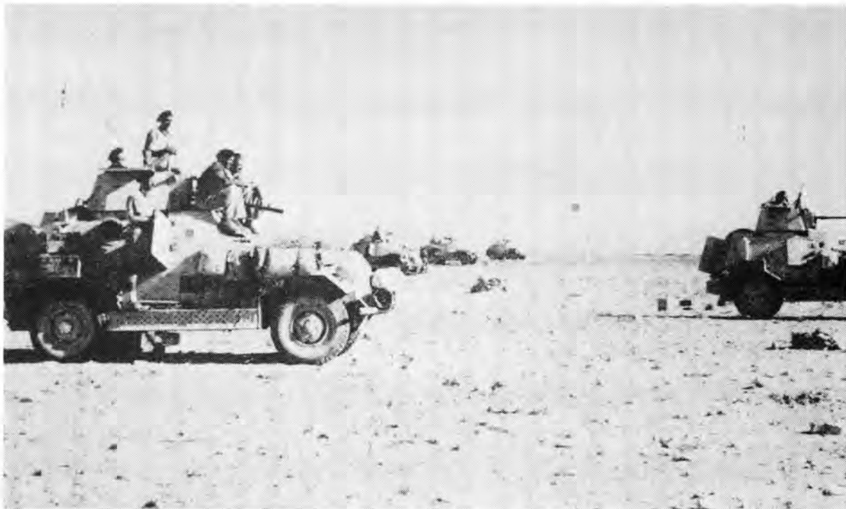
SA Armoured Cars at the halt in the desert of North Africa

The South Africans suffered 23 625 casualties.