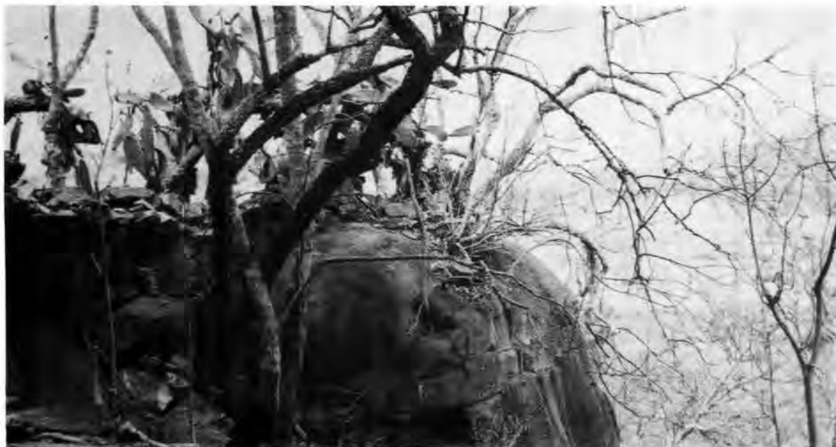
The inaccessible mountain stronghold of the Mapoch Chief Nyabela

Lobedu resistance to White settlement of the Woodbush area led to the dispatch of commandos which, with the assistance of Shangaan auxiliaries suppressed the "rebellion" after a protracted campaign.