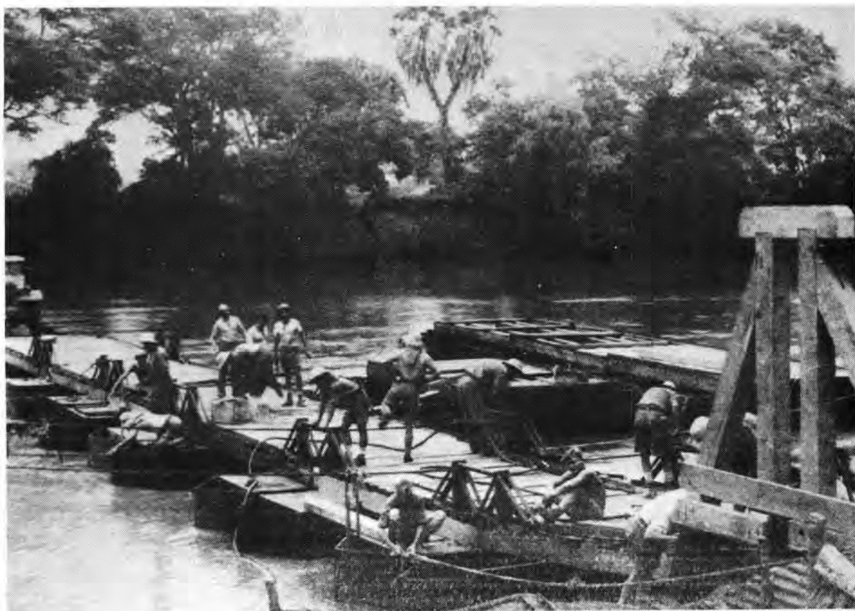
The first pontoon bridges built by South Africans in Kenya, mid-June 1940 by 16 Field Company