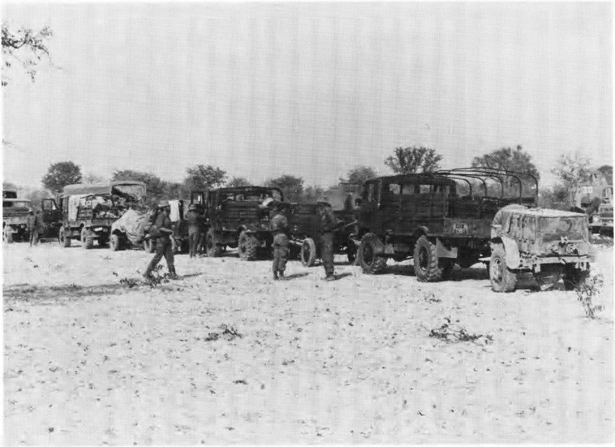
South African Soldiers in Angola