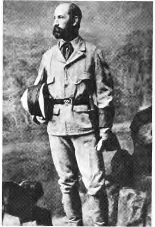
Maj-gen Sir George Pomeroy Colley killed on Majuba during the First War of Independence, 1880–1881

Late in 1880 Boer passive resistance to the British administration of the Transvaal developed into armed resistance. The British garrisons were quickly besieged in their towns and the relieving forces under General Colley were prevented from entering the Transvaal. Eventually terms were agreed which included the retrocession of the Transvaal to the Republican leaders.