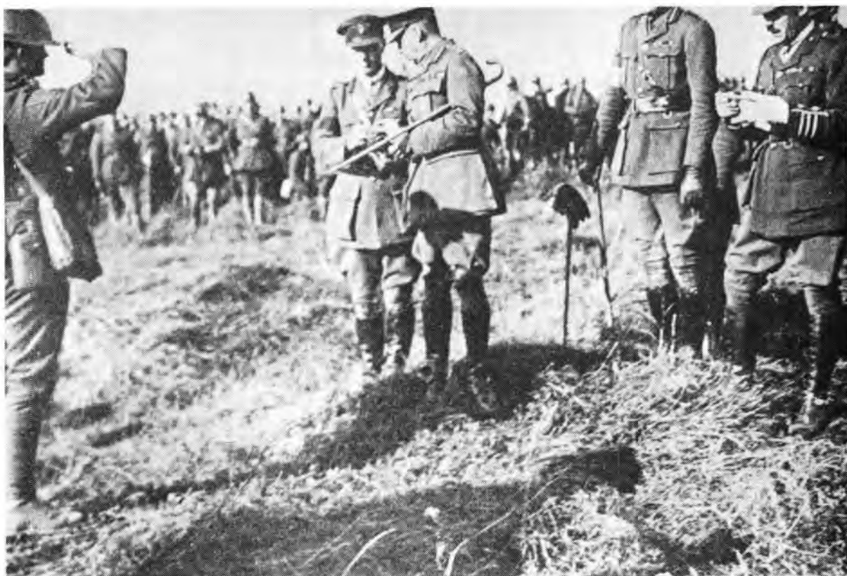
Maj-gen Sir H.T. Lukin presenting decorations at the Delville Wood Memorial service on 17 February 1918