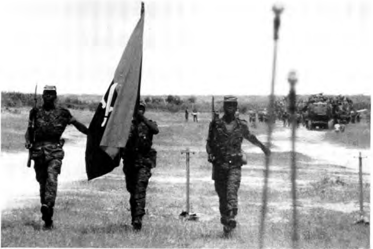
The Angolan Flag is marched from the parade ground, after the parade was dismissed.