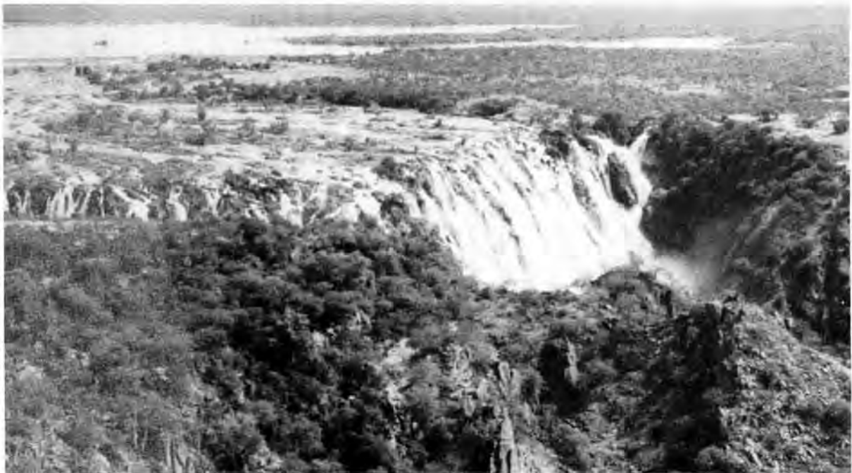
Ruacana waterfall with the embankment in the background.