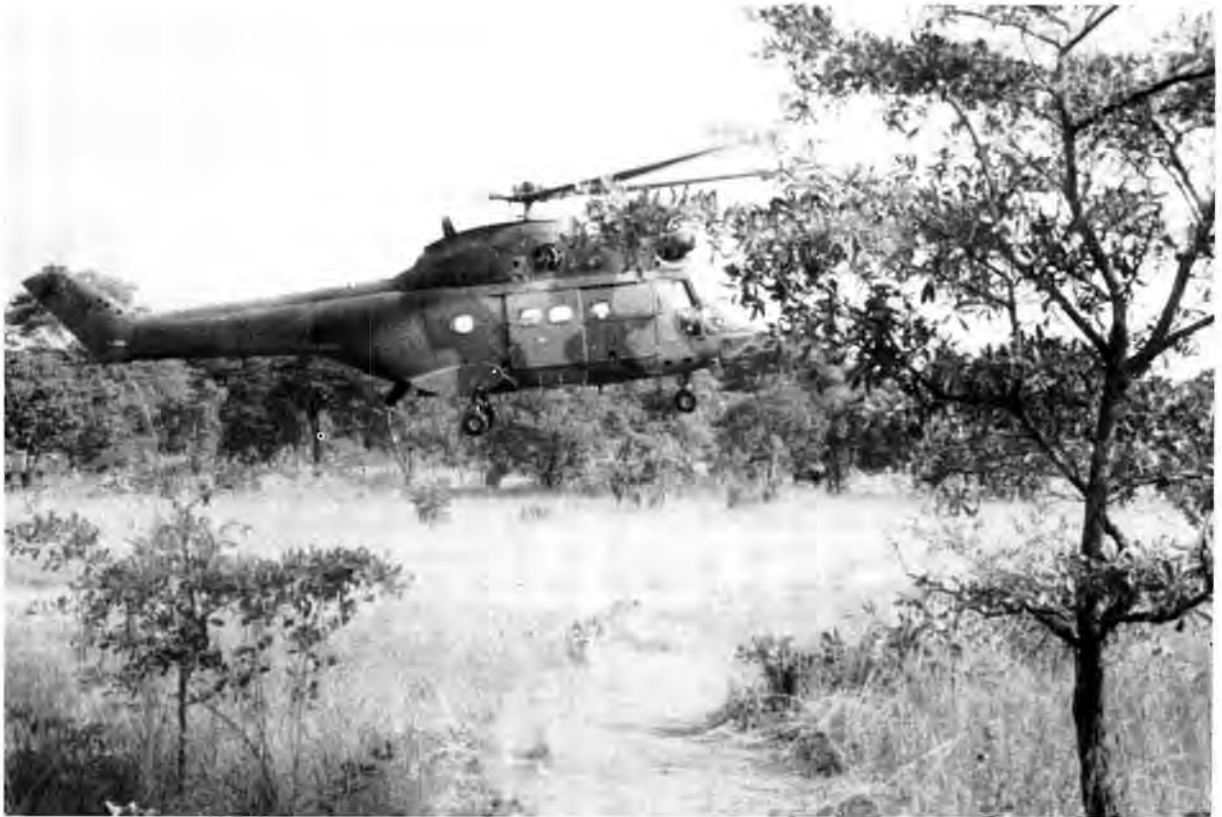
A Puma helicopter lands in the bushes at Cuvelai. Base (RSA) can be seen in the background.