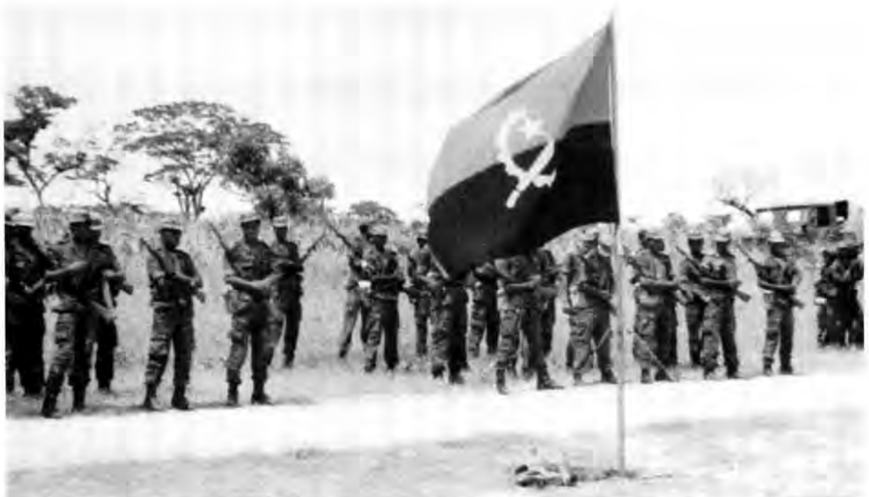
On 1 March 1984 a JMC parade was held at Cuvelai Airfield. Troops of both parties with both the RSA and Angolan flags were on parade.

The Fapla JMC component agreed to immediately have all Fapla patrols recalled from south of the monitor line and also accepted that the move to Mupa could not take place on 7 March as planned. 12 March was provisionally agreed on as the new date if the situation had improved by then.