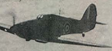
Hurricanes in formation during the battle of Britain

he will survive for at least seven days!