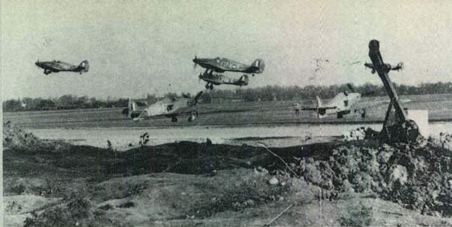
Hurricanes of No 249 Squadron get airborne

I broke over the bombers because I was too close to break away below. I remember diving earthwards in the middle of the bomber formation. I opened fire with more than full deflection and let the Do fly into the bullets like a partridge.