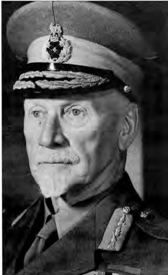
Field Marshal J.C. Smuts disposed of a large number of documents between 1946 and 1948, which may have tarnished the image of the United Party.

the Intelligence Section and had them sent under guard to Cape Town, where the Minister of Defence was attending the sitting of Parliament.