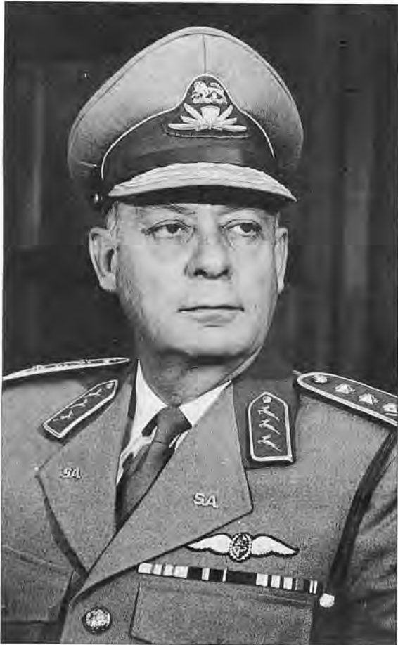
General (then Colonel) R.C. Hiemstra was Minister F.C. Erasmus' man on the spot during the 1948 archives investigations.

made a study of the military archives system in the Netherlands. Posthumus found that the staff were not only archivists but also historical writers. Military records were kept for a reason - in South Africa they were barely being used. Furthermore, the Dutch military