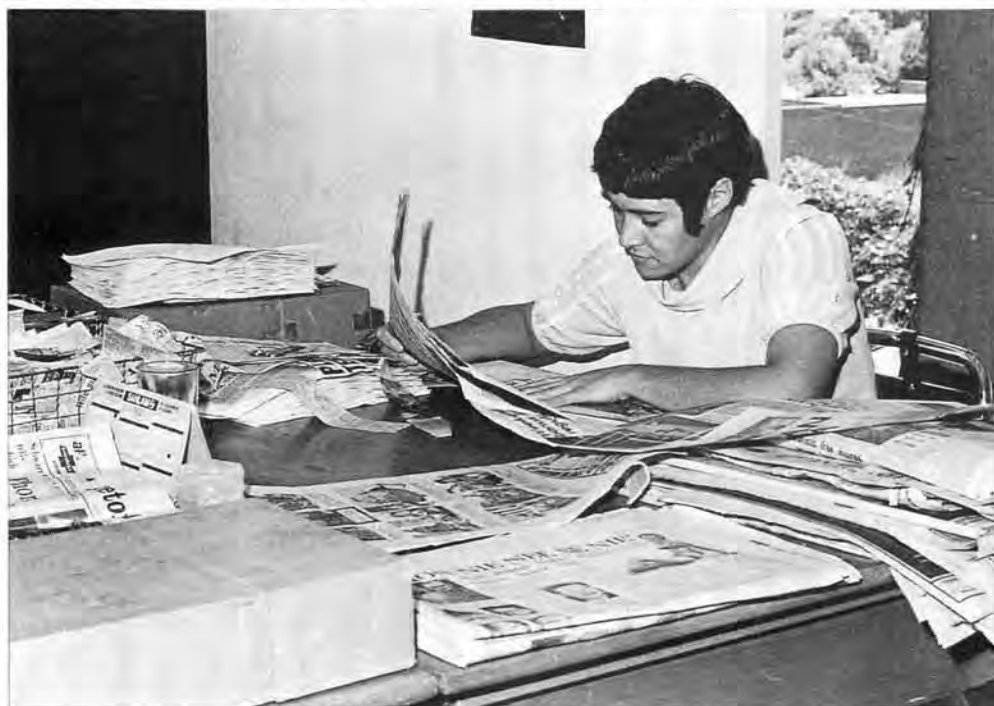
The newspaper cutting department of the Military Information Bureau.

Black Publication series. However, from the mid-seventies, the practice of military history within the SADF began to lose momentum. The addition of all the non-historical functions to the Military Historical and Archival Service and its successors, from the early seventies, had begun to tell. Much of the resources which should have gone into historical projects were tapped off for other projects and other publications. The effect is clearly discernible. The