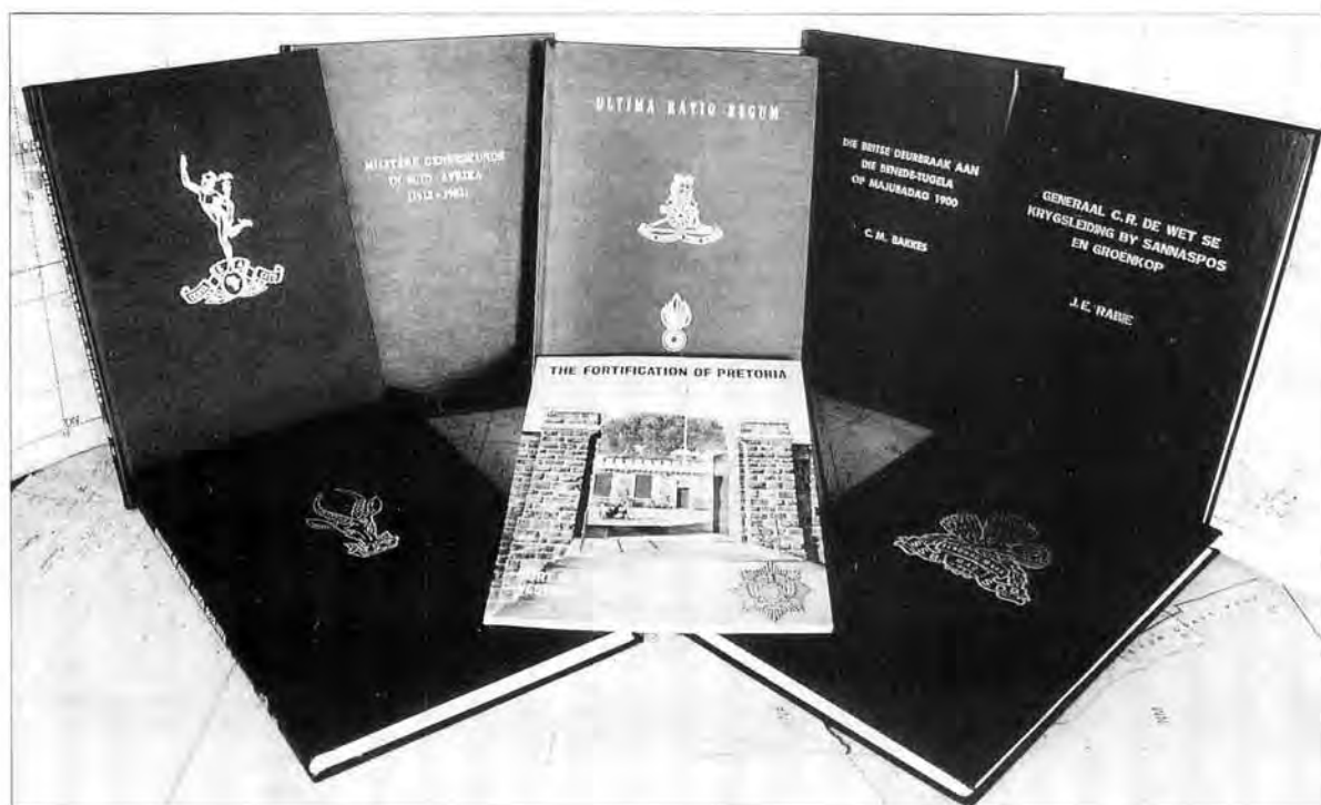
The Black Publications Series. The last number appeared in 1987.