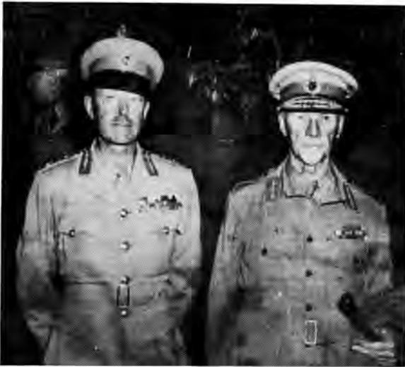
Field Marshal Alexander and General Smuts, in Italy.

tered in Libya. It would have to operate in mountainous country, ideally suited to defensive warfare, and attack positions manned by a skilful and stubborn enemy. In summer, rain and mud, in winter, snow and intense cold would impede an advance. There was little scope for turning movements. The enemy would have to be driven from his positions by sheer hard fighting.