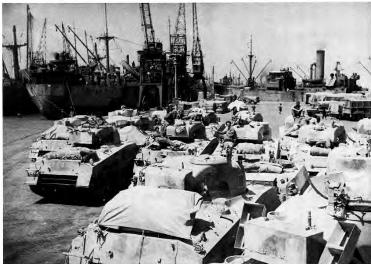
The 6 SA Armoured Division has joined other South African Forces in Italy. This picture shows a middle east port during the embarkation of the division after thorough training as an armoured division.

In April 1944 the Division crossed to Italy and concentrated in the Altamura-Matera-Gravina area. The conditions facing the Division were very different from those encoun-