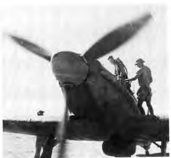
SAAF Hurricane. The Vokes air filter, installed to combat the sandy atmosphere can be seen below the propeller.

In all 2344 sorties were flown in July and 39 enemy aircraft destroyed.