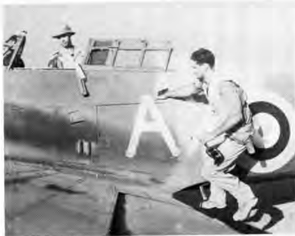
SAAF plane and pilot about to take off.

others at Direidawa, and on the 4th April, two days before the entry of the land forces, 30 aircraft were destroyed on the aerodrome of Addis Ababa.