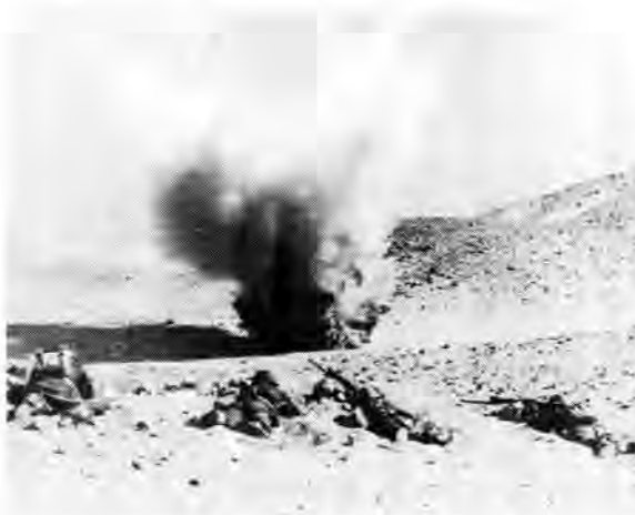
Action in the desert.

made contact with the enemy, and until the 22nd November, remained in the area, with artillery active in both sides, and the air force active on the enemy's side.