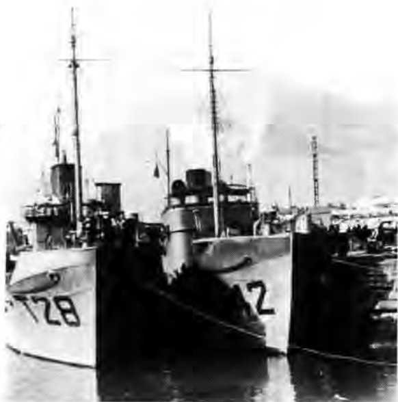
SANF minesweepers at Cape Town.

left for the Mediterranean to join the Fleet. They were known as the 22nd A/S Flotilla, and arrived in Alexandria on January 11th, 1941. The position in the Mediterranean was then highly critical, and the small flotilla was almost immediately used to protect the exposed sea-route to Tobruk, a type of work quite new to the officers and men.