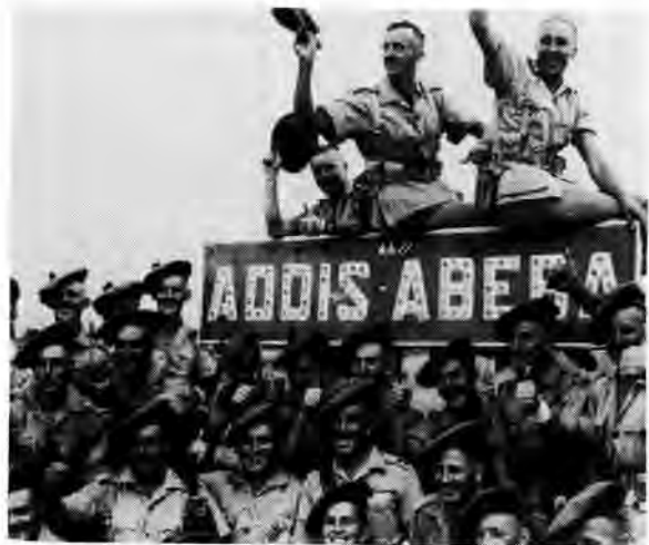
Transvaal Scottish entering Addis Ababa.

A landing at Berbera, when 11 Division was approaching Jijiga, greatly shorted the lines of communication. At the end of March, 2 SA Infantry Brigade was despatched there to help clear up isolated pockets of enemy in eastern Somaliland.