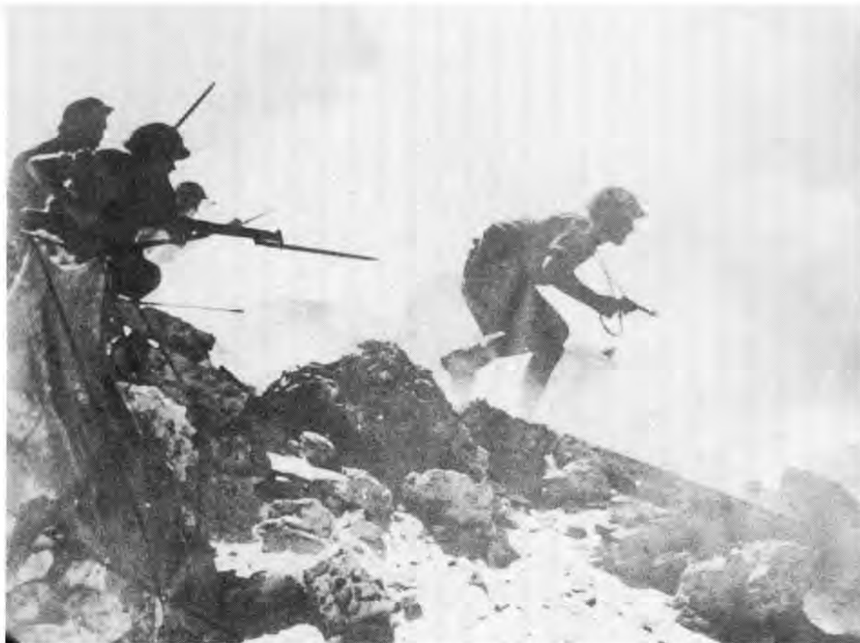
El Alamein – a scene from the film "Desert Victory".