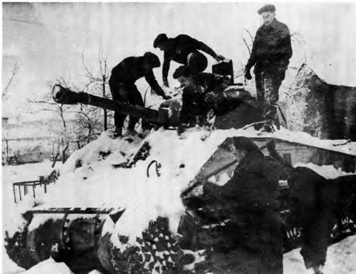
A Sherman tank in the Appenines: 1944.

The casualties suffered by the Division during this period totalled 2 042.