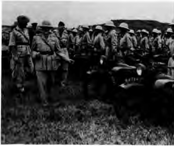
General Smuts inspecting South African forces in East Africa.