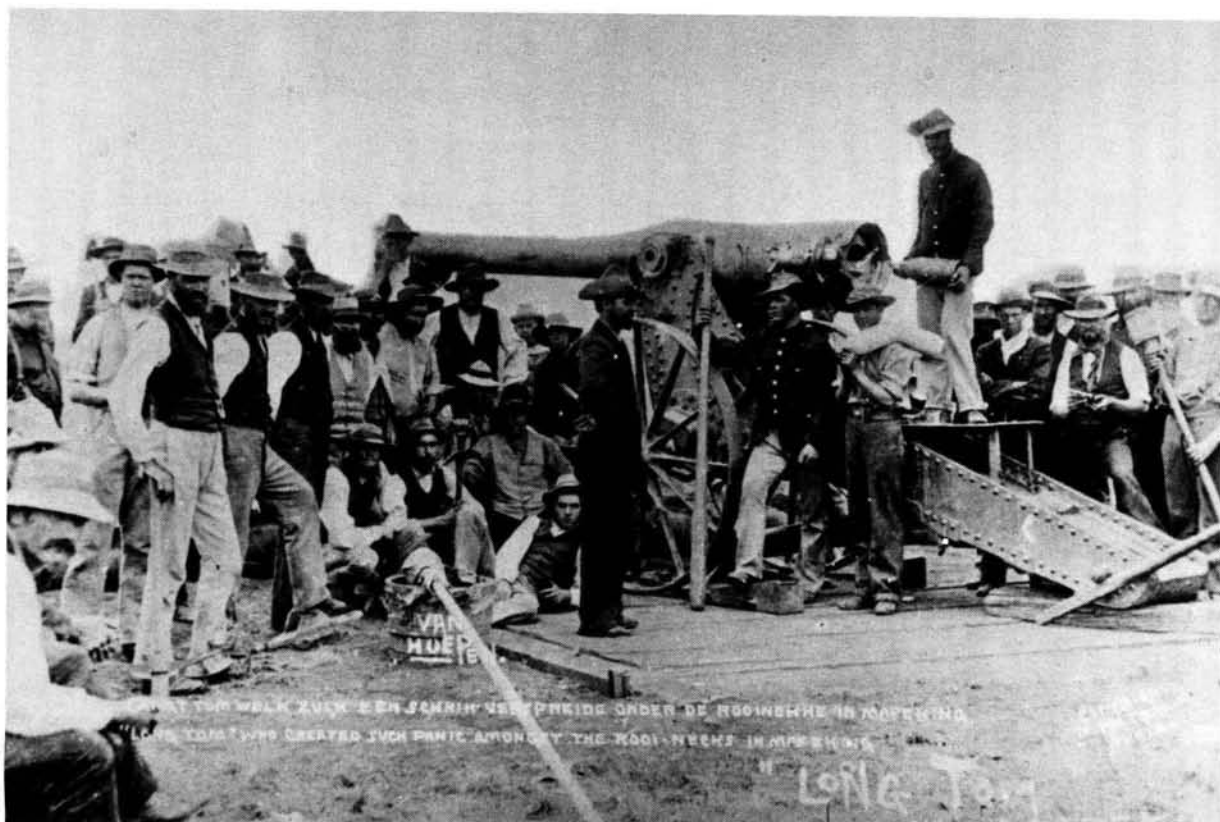
The 'Long Tom' used by the Boer artillery during the siege of Mafeking.

Heavy guns (bombards) in Germany gave way already in 1385 to lighter ones mounted on wood and supported by a fork, hence the word Hakenbüsche (corrupted by the English to Hackbutt , Hagbush and finally Harquebus ). Later a stock was fitted to the piece to enable it to be carried by hand. So the rifle developed from the gun. The Howitzer derives from the German Haubitze , which came into use in 1750.