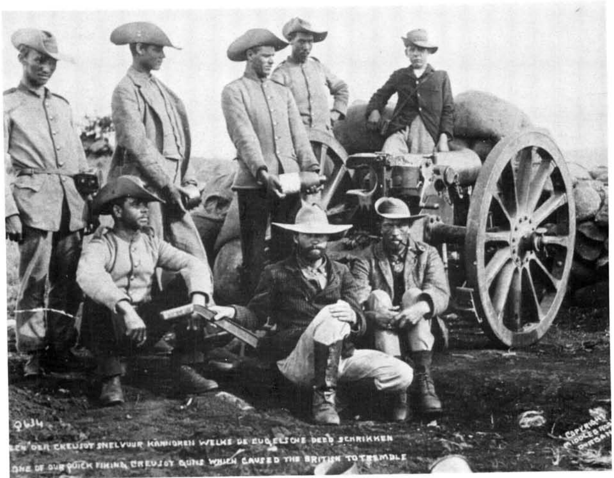
Creusot quick-fire gun used by the Boer forces.

ACF". From then on the South African Gunner tradition was born of individual regiments each with their own cap badges, but wearing the basic seven flame grenade as a lapel badge.