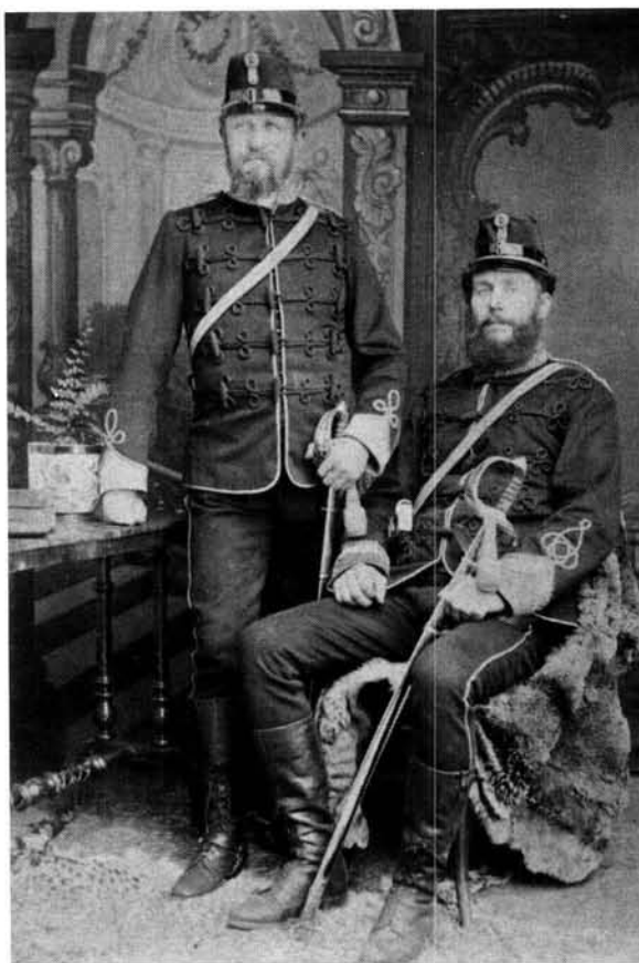
Traditional uniforms of the 'Staatsartillery' of the 'Zuid-Afrikaansche Republiek' in 1899.

South African gunners wear silver in common with the rest of the SADF but some, CFA and CGA as examples, continue to wear brass buttons while 2 Locating Regiment and Regiment Vaalrivier wear black grenades. In the volunteer units that existed before Union in 1910, it was a general principle that officers wore gilt badges and accoutrements and other ranks wore silver. This arrangement was retained to a degree in the THA where officers wear a black badge, non-commissioned officers wear silver and gunners wear a silver beret badge. Non-commissioned officers and gunners in the THA wear silver badges but the NCO's wear their badges on a red background. CFA members wear a bronze beret badge which caused much annoyance to a former Commandant General who insisted that it should be brass. However he admitted defeat after two almost disastrous confrontations. The cap badges had erroneously been issued by QMG in bronze and bronze the unit has decided they should remain (SADF Archive 3613).