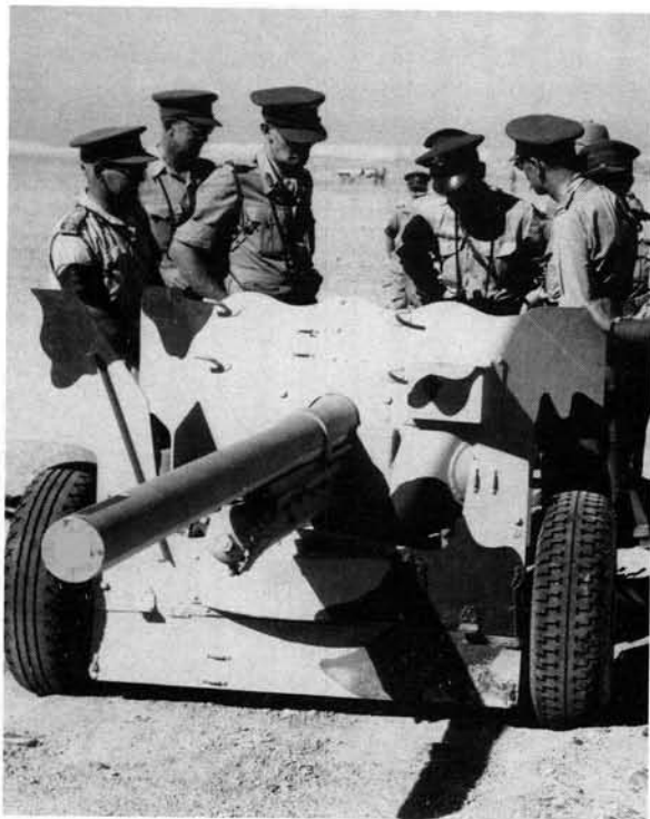
Major General A. Maxwell, MGRA, Middle East, discussing the new 6 pounder anti-tank gun with Col W.M. Randolph, of the US Ordnance when they and other senior officers visited the SA Artillery training wing in Egypt in 1941.

and 7 Medium Regiment refer to their sub-units by the numbers 71, 72 and 73, in line with modern practice which follows the unit number.