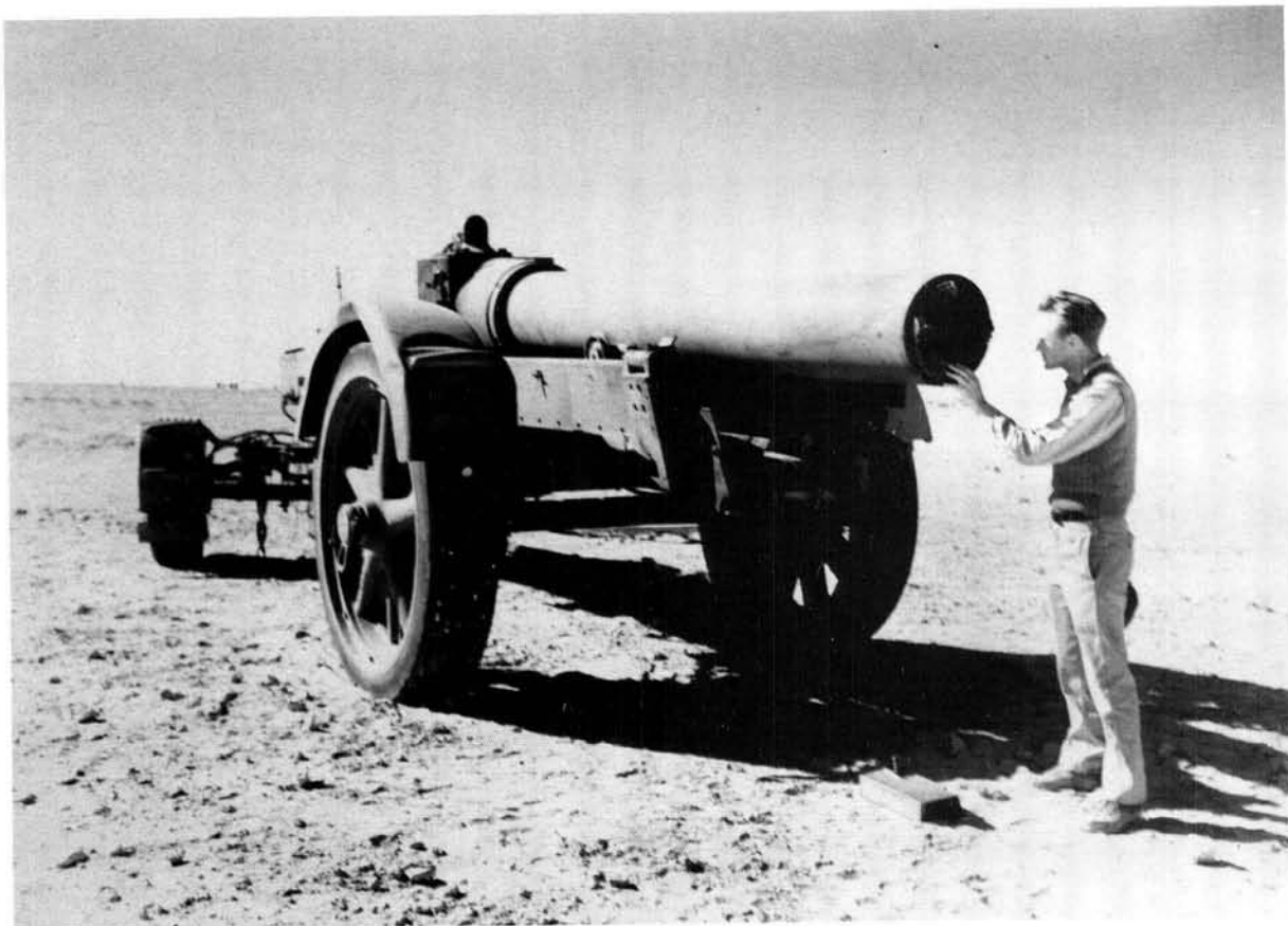
A 'spiked' German 210 mm gun of 1939 vintage seen near Mersa Matruh.

Guns were originally named individually and according to size after all kinds of monsters. The mortar was, for instance, derived from the German "Meerthier" (sea-beast).