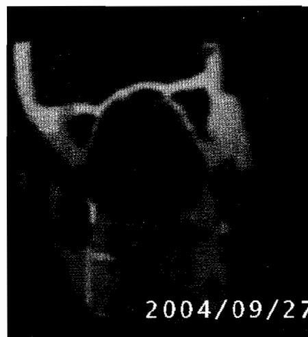
Figure (2): CT Scan coronal section (soft tissue window) showing big soft tissue mass occupying whole nasal cavity, bilateral maxillary and ethmoidal sinuses and extending to sphenoid sinus

Under local anesthesia punch biopsy taken from the left nasal mass revealed leiomyoma in histopathology.