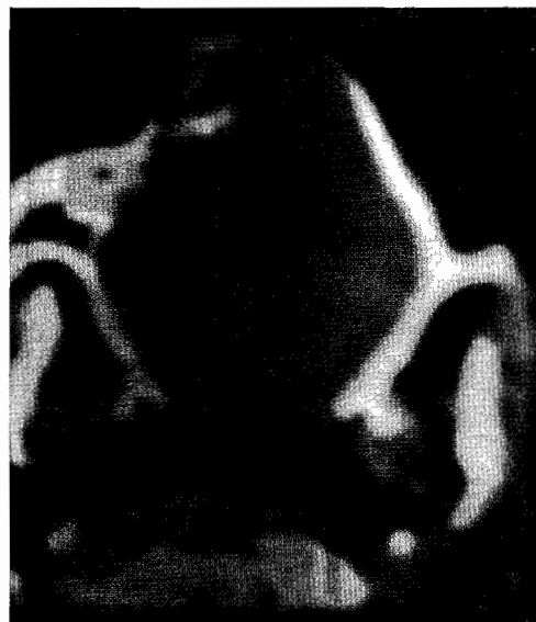
Figure (1): CT Scan axial section (soft tissue window) showing big soft tissue mass occupying whole nasal cavity and extending to nasopharynx