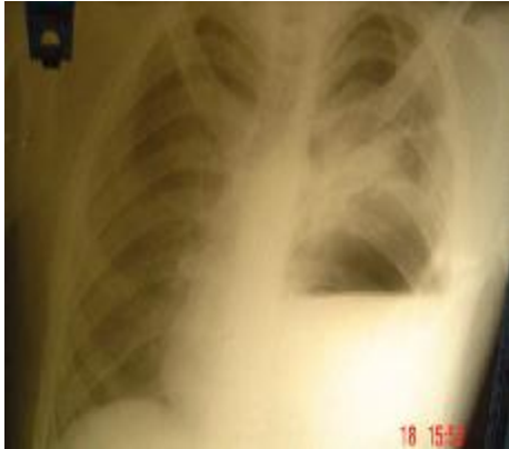
Fig 2: 3 rd chest tube in array.