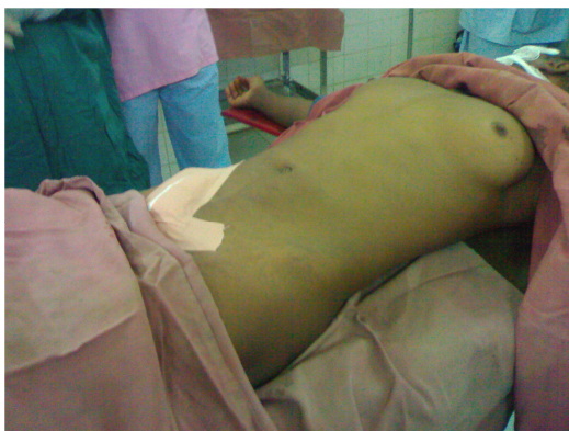
Fig 1: Well developed breasts

On physical examination she looked well, not pale jaundiced or cyanosed. Has well developed breasts (Fig 1). Chest and cardiovascular system were normal. Abdomen showed sparse pubic hair. There was a right groin swelling which was above and medial to the pubic tubercle, reducible and has a cough impulse. The left groin was normal. Local examination revealed normal female external genitalia. She was diagnosed as a case of right sided indirect inguinal hernia.