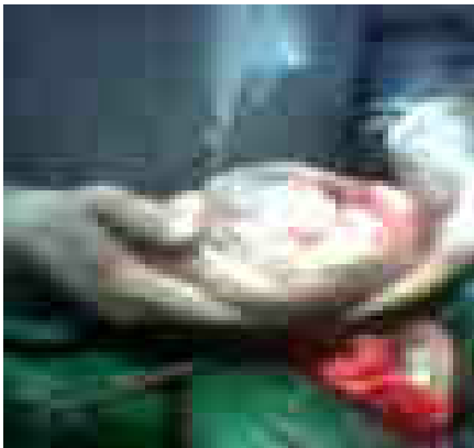
Fig 2: Right ovarian mass more than triple the hand fist in size.

The postoperative period was uneventful. The patient was discharged home and followed in the out patient department. The pleural effusion and ascites subsided and disappeared in four weeks time (Fig 3).