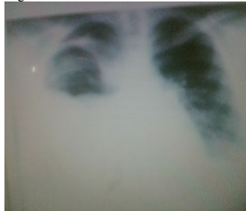
Fig 1: Bilateral pleural effusion more marked in the right side

During surgery a solid irregular right ovarian mass was found, with large amount of free fluid in the peritoneal cavity, but no evidence of infiltration of the adjacent organs, liver or peritoneal metastasis. Sample of the ascetic fluid was taken for cytology and the rest of the fluid was sucked out. The mass was resected and sent for histopathology (Fig 2).