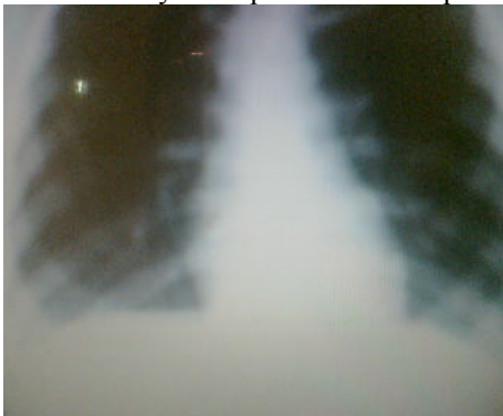
Fig 3: Chest X-ray at outpatient follow up

The postoperative period was uneventful. The patient was discharged home and followed in the out patient department. The pleural effusion and ascites subsided and disappeared in four weeks time (Fig 3).