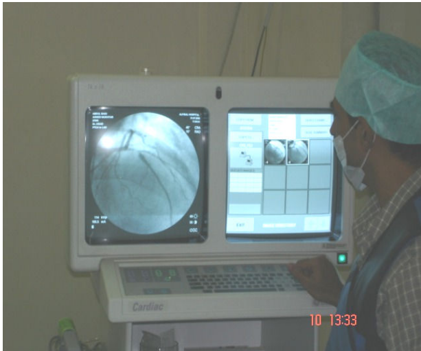
Al-Faisal specialized Hospital; an important new addition to modern medical services in Sudan. Physiotherapy, Cath.Lab., emergency and ICU services are available